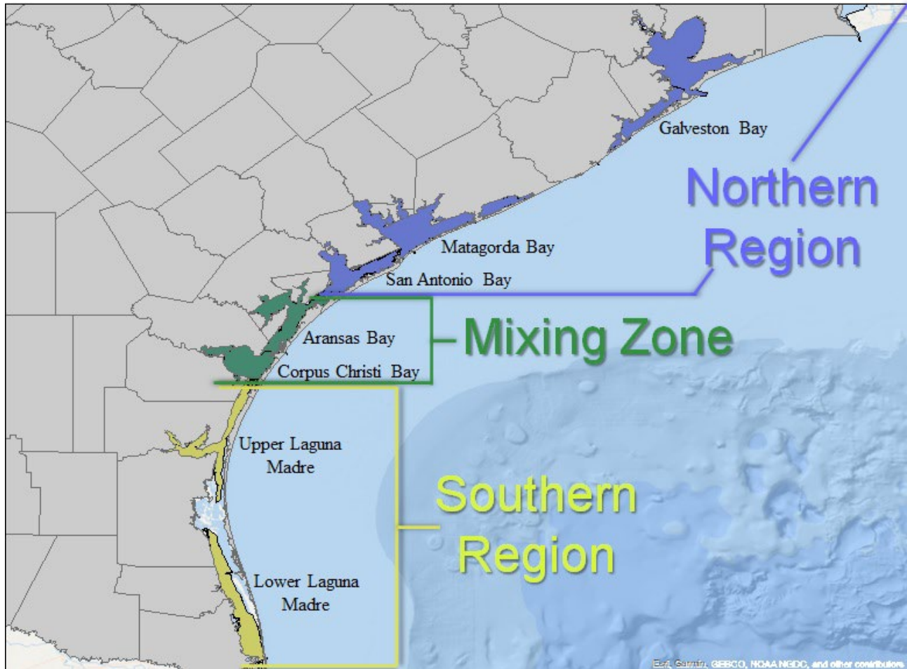
Figure 1 Map of oyster genetic regions in Texas.