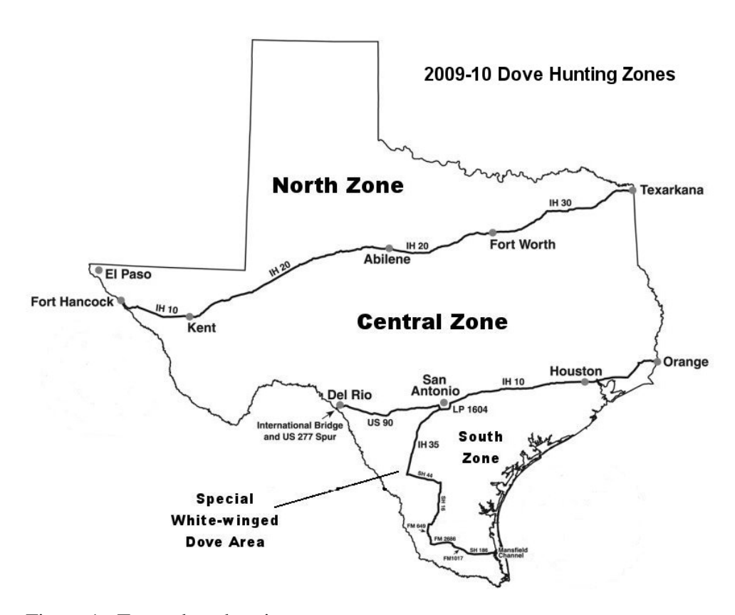
Figure 1. Texas dove hunting zone map.

South Zone hunters desire to begin their season as early as possible and run it as late as possible. The South Zone opens in mid-September rather than September 1<sup>st</sup> because previous studies have shown that approximately 11% of mourning doves in south Texas are still nesting in early September. The concession that staff received last summer from the Flyway and the Service to allow Texas to open on the Friday nearest the 20<sup>th</sup>, but not earlier than the 17<sup>th</sup>, is all the flexibility that can be expected on this matter.