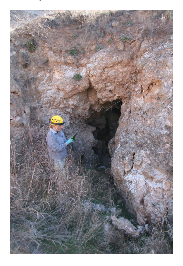
FINAL REPORT Submitted to Texas Parks and Wildlife Department May 20, 2013

Contract Number 433739; CFDA Number 15.634