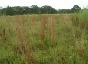
Figure 6. Native grasses mixed with bahiagrass. Natives will often emerge within fields dominated by exotic grasses following several growing season deferments. This type of response to deferment may lead to changes in management objectives