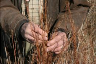
Figure 1. Little bluestem. This is a key native warm-season bunch grass (wildlife cover) that was once wide spread throughout much of Texas and beyond. This species is now absent from much of its range.