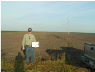
Figure 2. Annual photo points (same location/same direction) is a quick reference to identify herbaceous response to management activities.