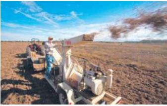
Figure 5. Bail busters help to expedite the spread of native grass hay. This process also adds beneficial humus to the soil adding to fertility and increasing the soil's potential to hold moisture.