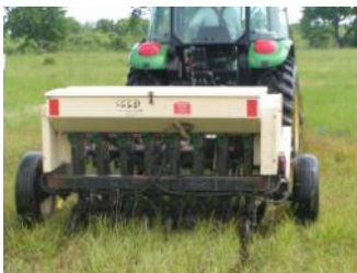
Figure 4. No-till seed drills with specialized hoppers for planting fluffy native grass seed such as this Truax allow for planting without necessarily having to prepare seed beds. Reducing soil disturbance reduces the risk of stimulating early successional invaders and invasive exotics plants.