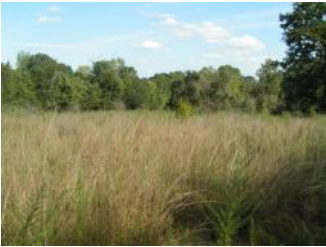
Figure 3. Natural re-vegetation of native grasses often occurs following grazing season deferments. Simple maintenance including periodic grazing, prescribed fire, or dormant season mowing can be utilized to revive native grasses.

Action 2. Natural Re-vegetation —This is a management option to eliminate the need to plant when a good native seed bank exists. Other actions, such as prescribed burns or herbicide applications, are often required.