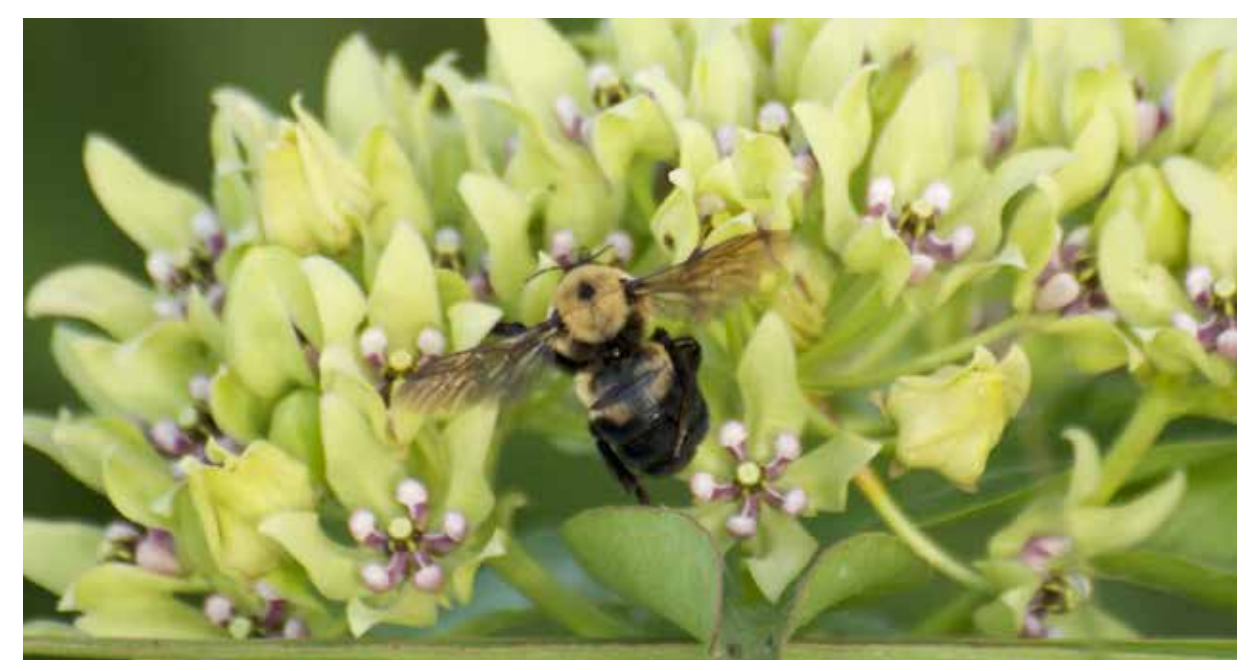
Brown-belted bumble bee. Jessica Womack.

The advantage of uploading your observations to iNaturalist is that it is composed of a community of amateur and professional naturalists who interact to identity species. Also, your data is recorded and organized in iNaturalist and can be downloaded to different file formats. Users can establish projects and "places" in iNaturalist to further consolidate data. If you choose, you could establish a dedicated place for your property alone or contribute data to an existing iNaturalist project. TPWD has established the project, Bees and Wasps of Texas as a data repository for private landowners conducting flower-visitor surveys and managing their lands for these species.