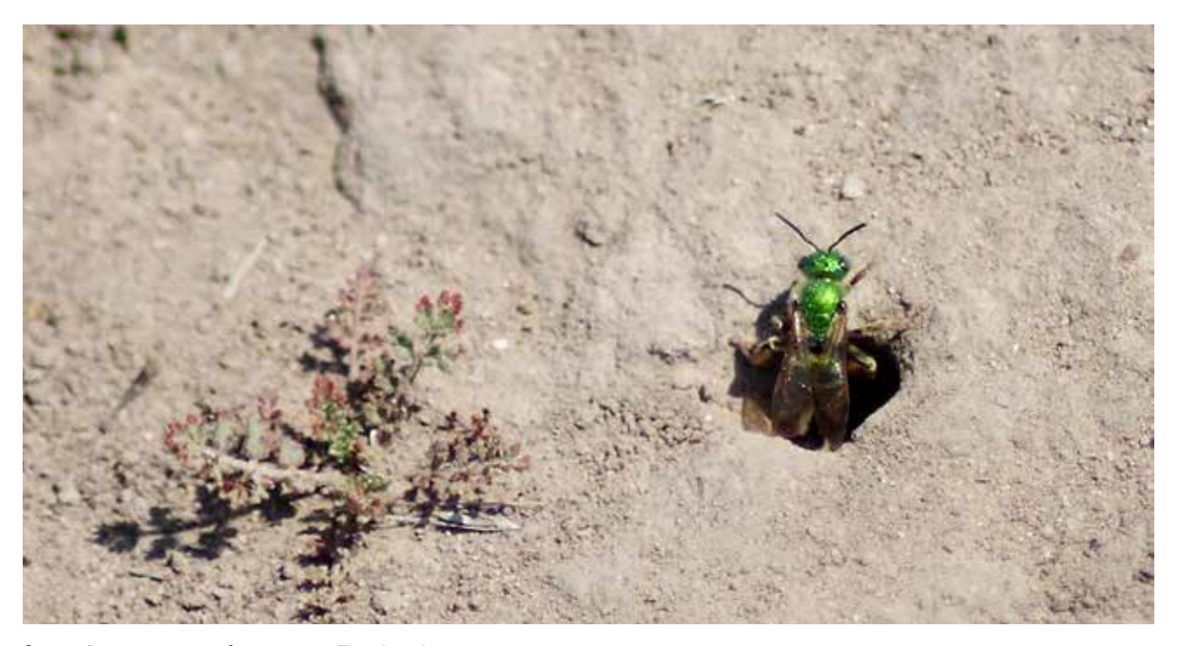
Sweat bee emerging from nest. Eric Jacob.

Existing nest resources will be a little harder to recognize than patches of flowering plants, but general nesting habitats across a property can be roughly demarcated. Brush piles, downed wood, and standing dead trees represent potential natural nesting sites for tunnel nesting bees and bumble bees. Well-drained, sparsely vegetated patches of bare ground are preferred nesting habitat for many ground-nesting bees.