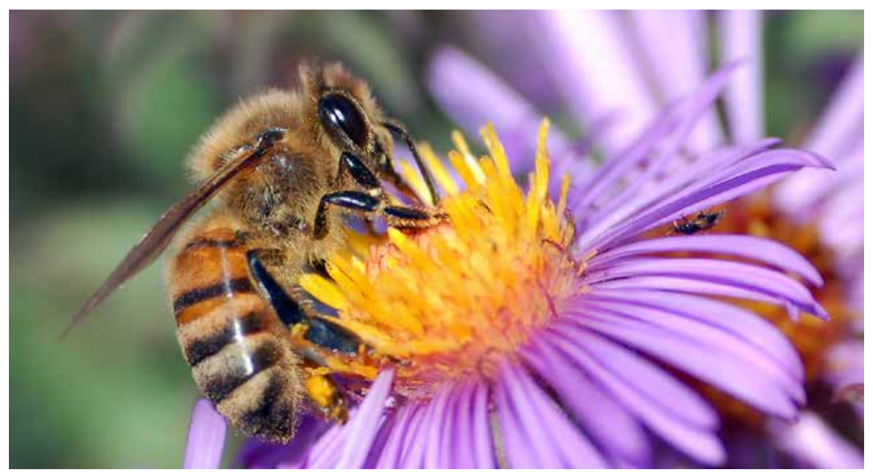
European honey bee.

Over 3,500 native bee species and roughly 30 non-native bee species have been recorded from North America north of Mexico. The European honey bee (Apis mellifera) is the most familiar and well-known non-native bee species in North America. Brought here in the early 1600s, honey bees now occur nearly continent-wide in the form of feral and managed colonies. The honey bee's status as a managed and easily transported insect has made this single bee species the most important pollinator of dozens of U.S. agricultural crops valued in the billions of dollars annually.