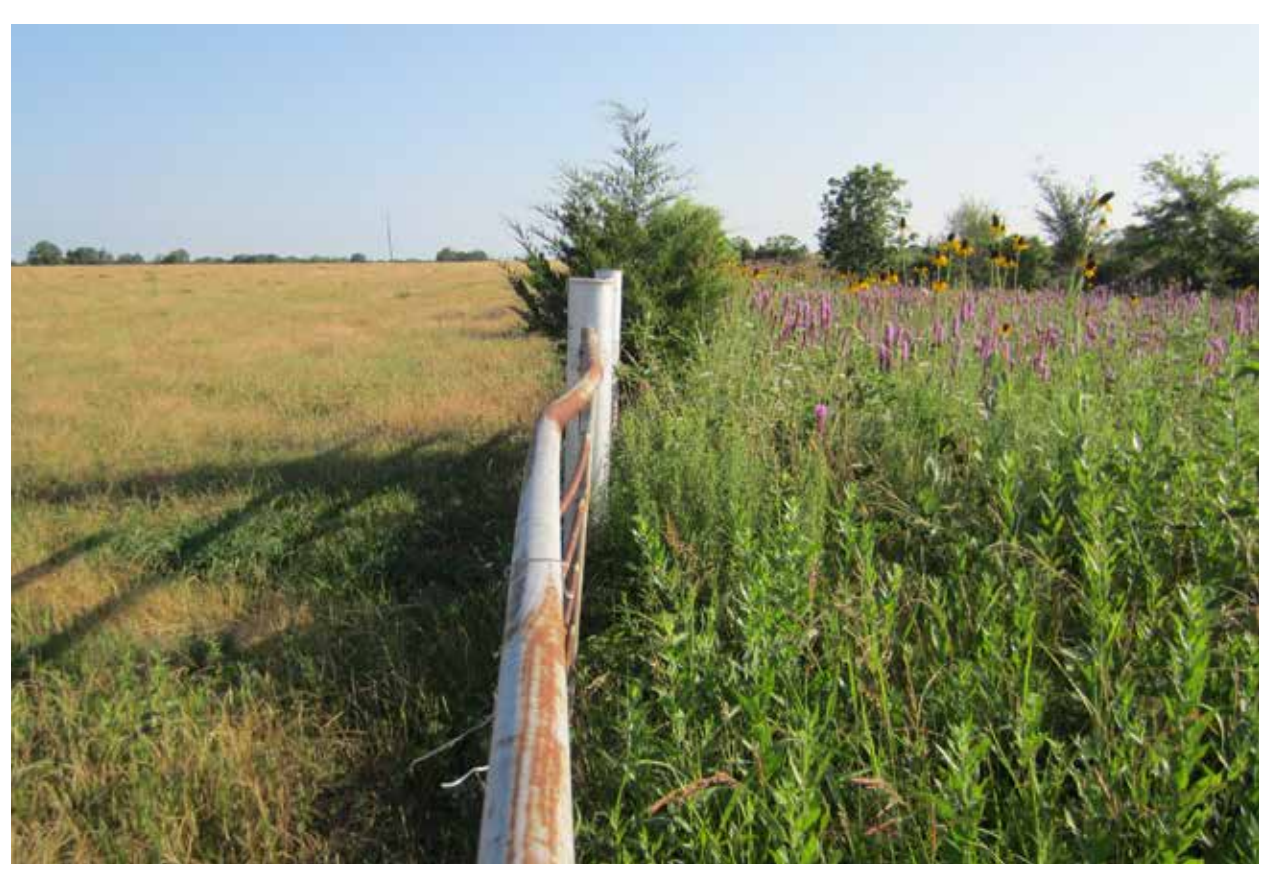
Non-native grass monoculture (left) versus flower-rich, good quality bee habitat (right). Michael Warriner.

As a general rule, only treat up to 30% of a site at a time. For example: if you have a 12-acre, flower-rich hay meadow, only cut four acres in a single year and rotate through the remaining acreage over the following years. Untreated areas of the property will provide much needed food and nest sites and also serve as critical refugia for species to recolonize the managed portion as it recovers the following year: