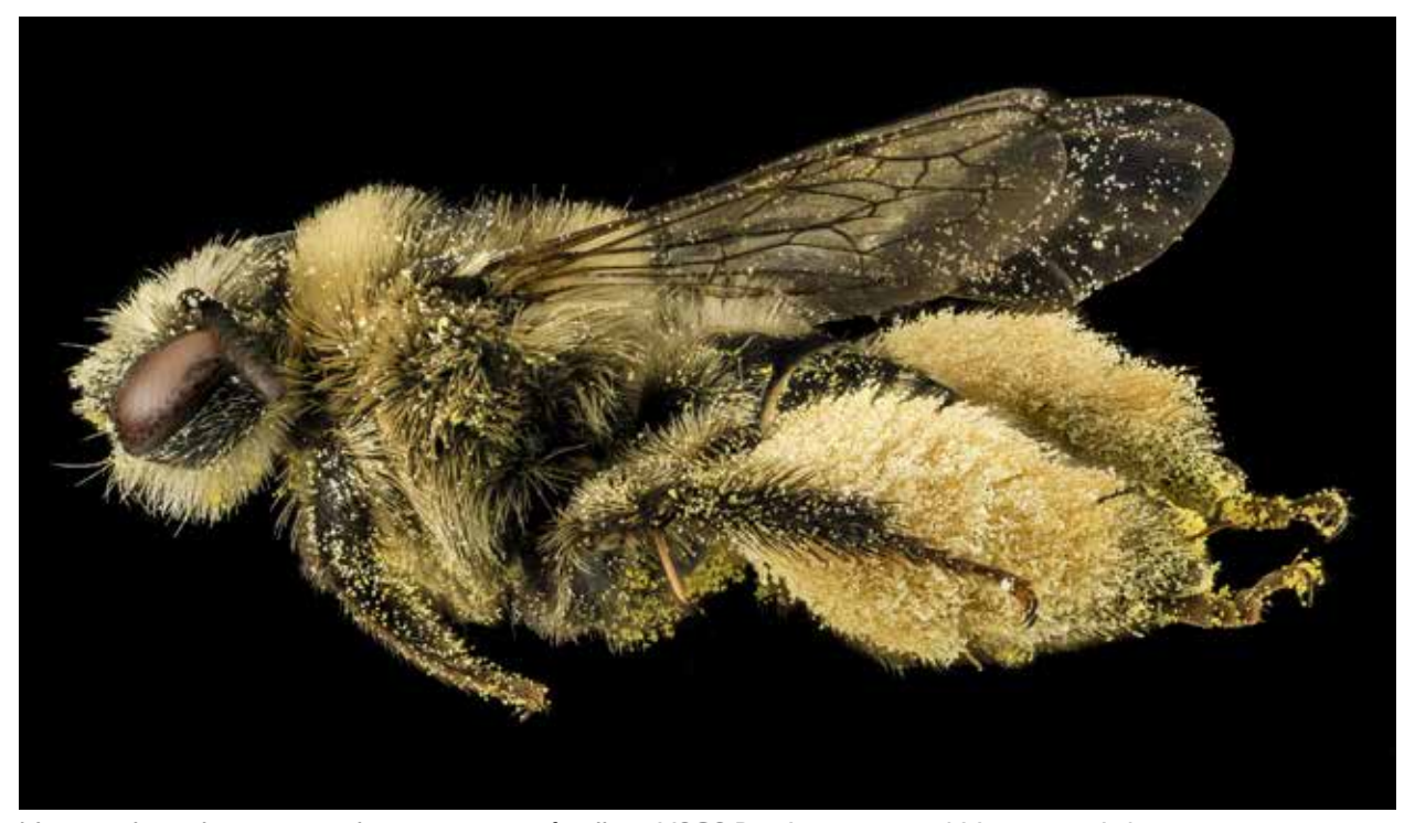
Native solitary bee carrying large amounts of pollen. USGS Bee Inventory and Monitoring Lab.

Animal-pollinated plants generally entice potential pollinators through showy flowers that offer rewards in the form of nectar and pollen. Nectar, composed of sugars and other compounds, is an important energy source for many flower-visiting species. Some flower-visiting animals, such as butterflies, hummingbirds, and moths, visit flowers only to feed on sugar-rich nectar. Pollen represents a source of protein and fats for a smaller subset of flower-visitors. Bees, while also feeding on nectar, are one of the few flower-visitors that purposefully forage for pollen, collecting and transporting it as a food source for their young.