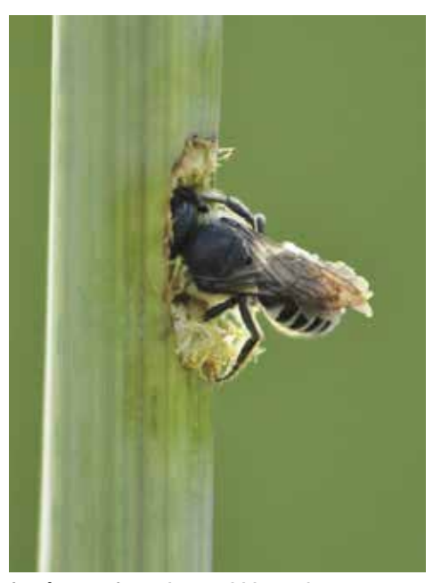
Leafcutter bee. Jessica Womack.

When appropriate, include shrubs or herbaceous plants with hollow or pithy stems that can provide nesting habitat for tunnel-nesting bees. Plants with stems that bees utilize include box elder ( Acer negundo ), sunflower ( Helianthus ), sumac ( Rhus ), wildrose ( Rosa ), elderberry ( Sambucus ), raspberry and blackberry ( Rubus ), cup plant ( Silphium perfoliatum ), snowberry ( Symphoricarpos ), ironweed ( Vernonia ), and yucca ( Yucca ). A minimum of 1% of the designated area must be treated annually to qualify.