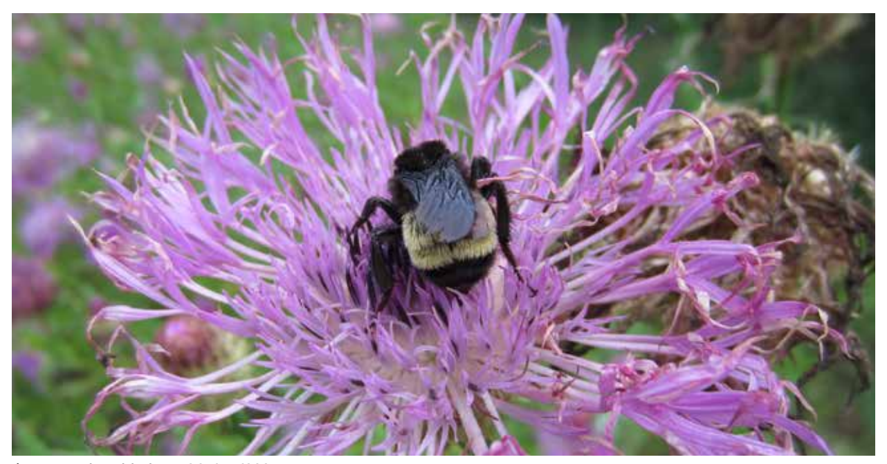
American bumble bee. Michael Warriner.

Exactly how you increase native plant diversity at your site will depend upon the current condition of the area you wish to manage. Properties with low floral diversity may benefit from over-seeding with a native seed mix including forbs geared to native pollinator needs. If over-seeding a site, emphasize seeds from local sources. Obtaining an as-local-as-possible seed mix is not only helpful for establishment success but also aids in the protection of existing local plant gene pools. Within the ecologically and environmentally diverse state of Texas, local seed may mean seeds sourced from the same ecoregion as the target planting site.