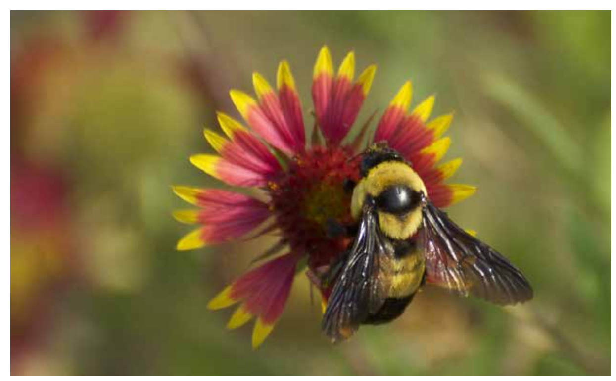
Southern plains bumble bee. Jessica Womack.

Watch where your shadow falls as a shadow cast over a patch of flowers may drive insects away. You will be looking for insects that are actively working flowers (hovering in front of, crawling over, and/or crawling into flowers). Do not record flower-visitors that just fly through your observation area. During your