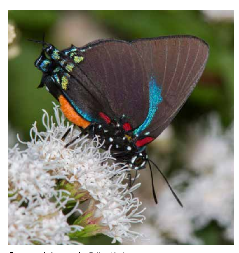
Great purple hairstreak. Cullen Hanks.

Along with nectar and pollen from flowers, native bees require suitable places to nest. Bees are considered central place-foragers, meaning that females conduct all of their