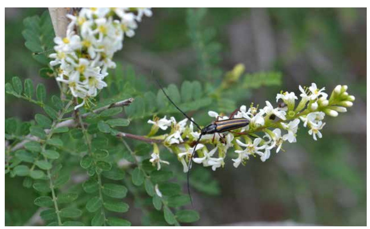
Texas kidneywood is attractive to a large number of flower-visitors. Michael Warriner.

Range enhancement should annually affect a minimum of 10% of the total area designated in the plan to receive credit, or a minimum of 10 acres annually, whichever is smaller. Refer to TPWD ecoregion-specific habitat control guidelines and guidelines for native grassland restoration projects (<u>Agricultural Tax</u>