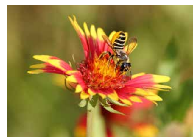
Leafcutter bee. Nick Mirro.

to provide diverse, high-quality nectar, pollen, and host plant resources is the establishment of native pollinator plots. These areas would consist of designated plots on a property that are seeded with a native seed mix containing a high percentage of herbaceous flowering plants along with a smaller native bunchgrass component. These mixes should follow the general recommendations for Range Enhancement but would be applied at a smaller scale. A percentage of the plot could also be planted with smaller native flowering trees and shrubs, in areas that are compatible with site management plans.