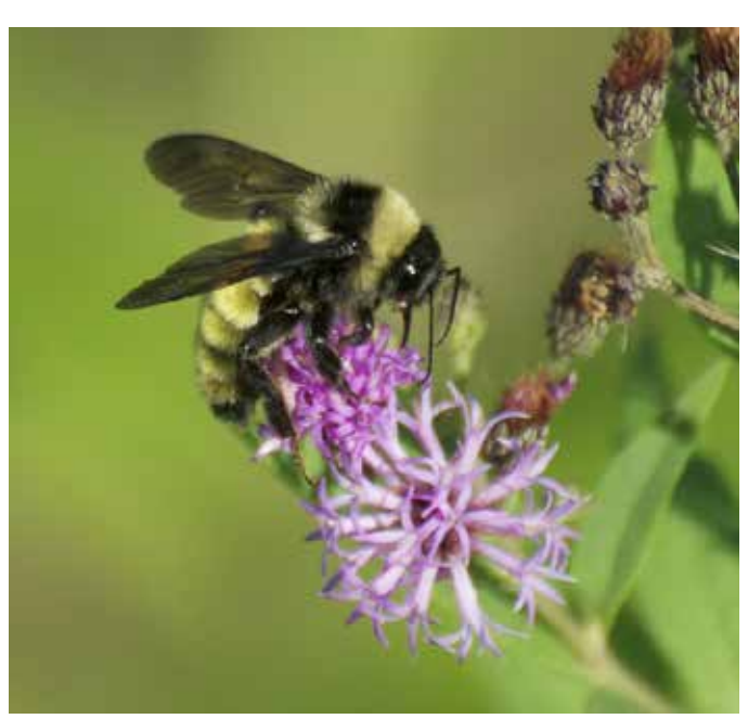
American bumble bee. Jessica Womack.

Refer to NRCS <u>Conservation</u> <u>Practice Standard for Restoration and Management of Rare or Declining Habitats (Code 643)</u> to prepare a habitat for protection for species of concern proposal for your plan.