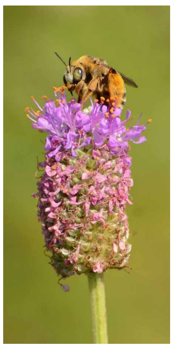
Ground-nesting solitary bee.