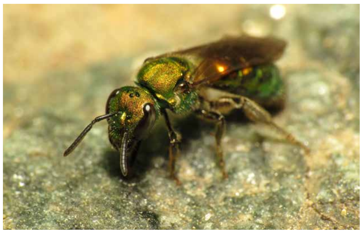
Sweat bee. Katja Schulz.

You can keep things simple by just concentrating on major groups of bees and other flower-visitors or surveying only for target species. Plan on bringing a digital camera/smart phone with you to