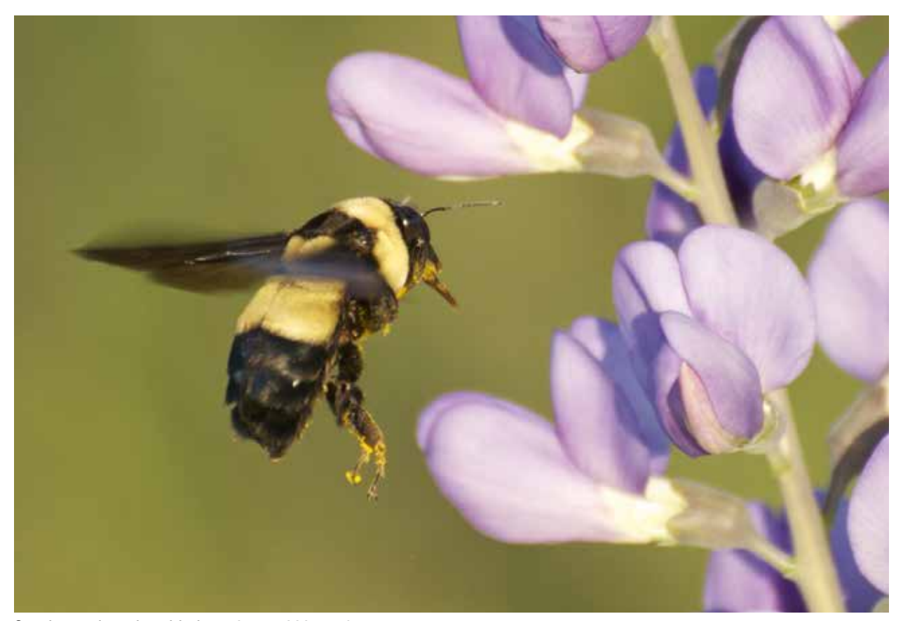
Southern plains bumble bee.

Many members of the general public are fearful of bees and other stinging insects. This fear is based on the defensive behavior some social insects display when their colonies are disturbed. Truly social insects live in cooperative groups composed of a queen and her daughter workers. Colonies of bald-faced hornets (Dolichovespula maculata), European honey bees, paper wasps (Polistes), and yellowjackets (Vespula) are well known for issuing contingents of workers to ward off perceived threats with venomous stings. Social bees and wasps are most defensive at the nest site where they have much to protect (queen, eggs, larvae, stored food). While foraging among flowers for food, social bees and wasps are often oblivious to the presence of humans or simply fly away when disturbed.