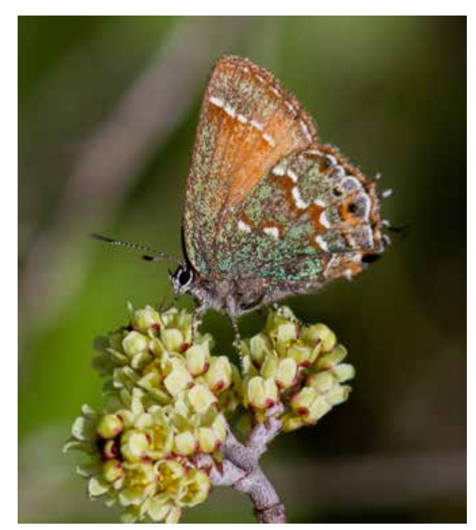
Juniper hairstreak. Cullen Hanks.

Site selection for native bee plots should consider existing non-native, invasive plant pressures and available methods of weed control. Site preparation and plant establishment should be accomplished according to the appropriate NRCS conservation practice and specifications (consult your local NRCS agent or TPWD biologist for more information). Either broadcast seeding (spreading seed over an area by hand or hand-held spreader) or mechanical seeding using a no-till drill calibrated to native seeds can be employed to plant seed, depending on the plot's size and topography. Application rates may differ among species planted. Preparing the seedbed is crucial. Where broadcast seeding is used, the soil surface should be disturbed by raking or very shallow disking to promote good seed to soil contact. Raking the soil following broadcast seeding or using a roller or cultipacker to press seed into soil (when practical) will aid with this as well.