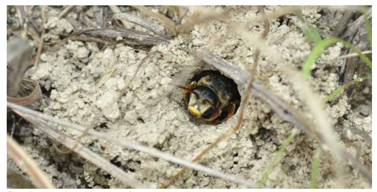
Ground-nesting solitary bee emerging from nest. Michael Warriner.

In contrast to ground-nesting bees, other species such as many carpenter bees, leafcutter bees, and mason bees nest in cavities in dead wood or the pithy stems of herbaceous plants. Creating piles of dead woody vegetation from brush clearing can provide suitable nesting habitat for several native bees and a number of other wildlife species. If you lack standing dead trees, girdling select trees is another option for creating dead wood habitat for native bees, woodpeckers, and other species. Remember to consider the tree's proximity to areas of human activity, roads, and structures, before girdling it.