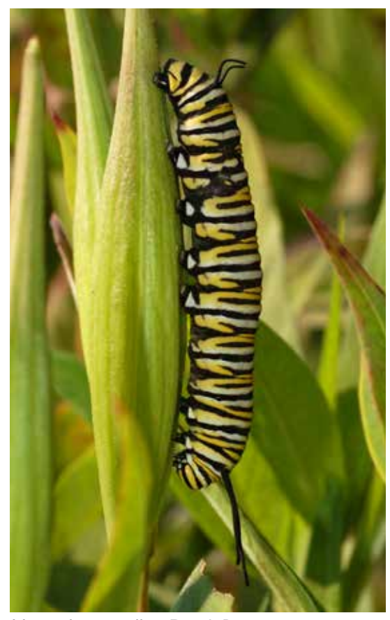
Monarch caterpillar.