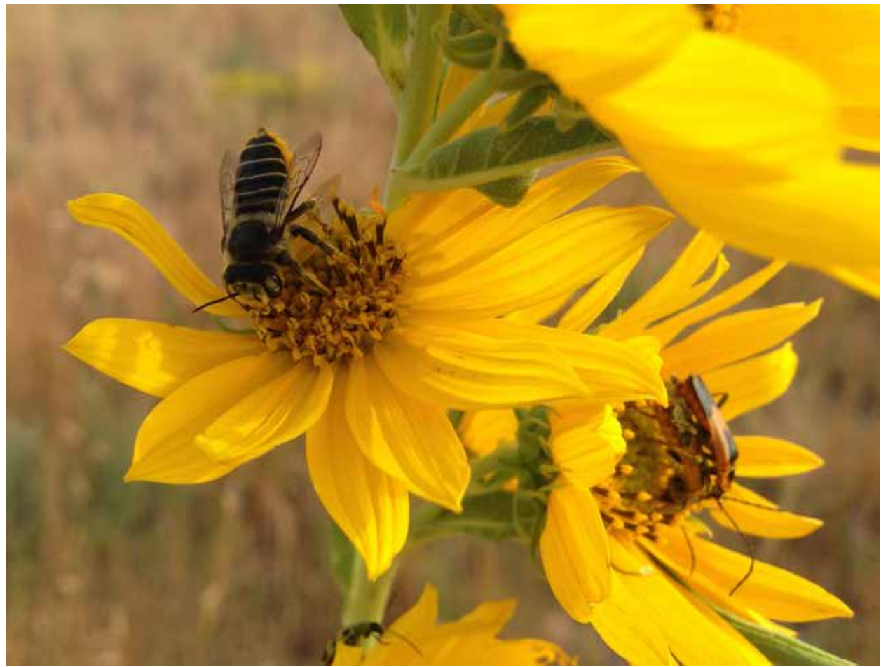
Leafcutter bee. Michael Warriner.

In Texas, as in most of the world, insects serve as the primary pollinators of the majority of native plants and are the most important pollinators of agricultural crops. As discussed below, some insect groups are more efficient and effective pollinators than others. These species are ideal focal targets to support overall native pollinator diversity. Implementation of practices to enhance pollinator habitat will also benefit a great number of species dependent upon diverse native plant communities.