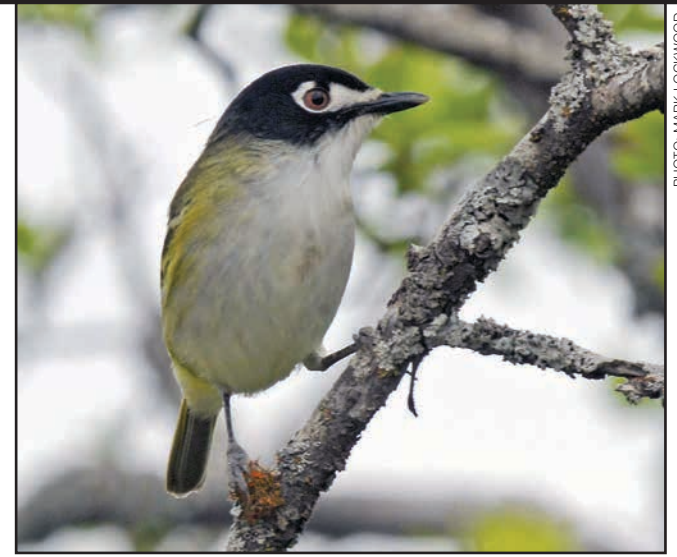
The rare Black-capped Vireo, a specialty of the Edwards Plateau, breeds at Kickapoo Cavern State Park.