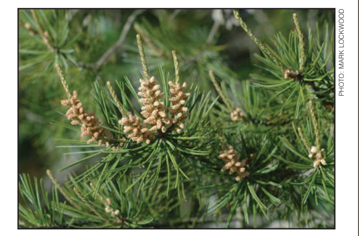
Papershell pinyon rely on Kickapoo Cavern State Park's unique ecological conditions to survive.

A large mound of burned rock and chipped stone near the cave shows visitation by prehistoric Native American groups. In dry periods, a small pool deep within the cavern likely provided these early visitors with life-sustaining water. Although the cavern was presumably named for the Kickapoo Indians, archeologists are unsure whether this historic tribe actually visited the cave. Historic graffiti and layers of torch soot in the depths of the cave document explorations that began around 120 years ago during the time of European settlement.