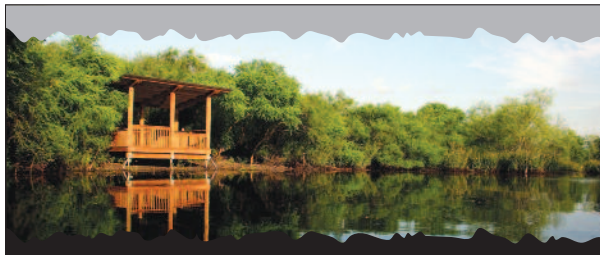
Resaca de la Palma SP - Brownsville, Texas