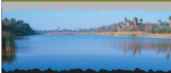
Bentsen-Rio Grande Valley SP - Mission, Texas