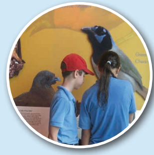
Exhibit Hall, Garden and Gift Store Visit

Another favorite for students is having a chance to visit the gift shop for that special souvenir. Groups of students will be rotated through the store, exhibit hall, and also get to explore our gardens located at the headquarters. The exhibit hall is comprised of interactive displays explaining the history, habitats, and wildlife of the area. The garden walk will discuss how the land has been transformed into the lush habitat you see today that was once farmland.