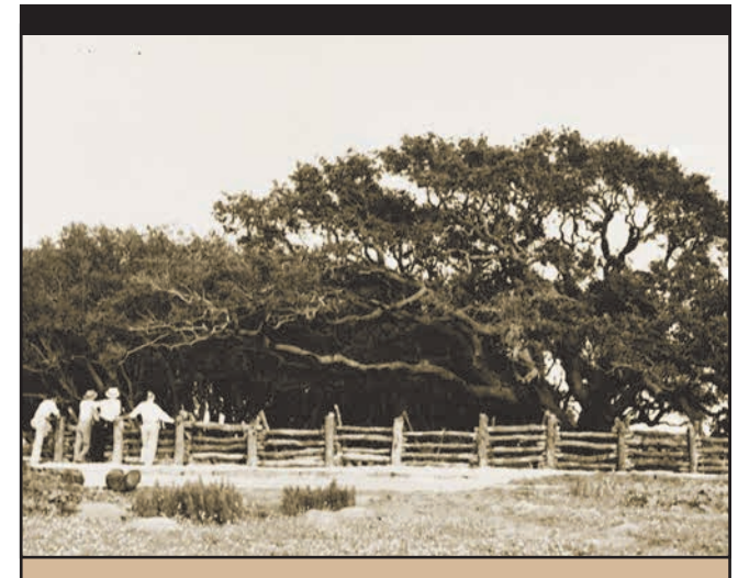
The "Big Tree" circa 1935.

THANKS TO THE WORK OF THE CIVILIAN CONSERVATION CORPS AND STEWARDS THAT FOLLOWED, GOOSE ISLAND STATE PARK ENDURES. TODAY, YOU CAN STILL STAND IN THE SHADE OF THE ANCIENT "BIG TREE," FISH IN SAINT CHARLES OR ARANSAS BAYS, AND WATCH WHOOPING CRANES FEED IN NEARBY MARSHES, ALL OF WHICH HAVE BEEN DONE BY OTHERS FOR CENTURIES.