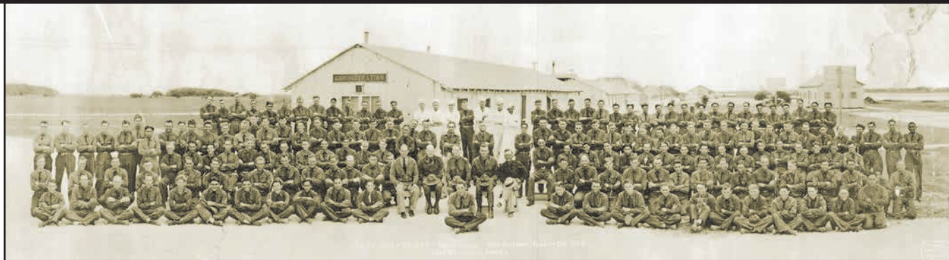
Civilian Conservation Corps Company 1801 in December 1934