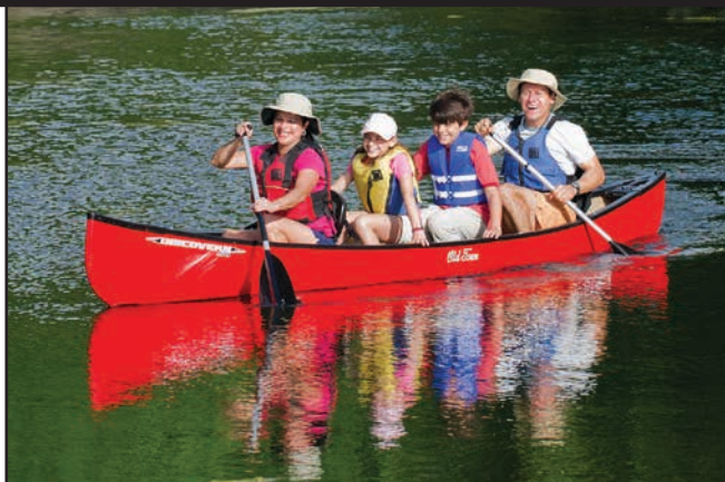
Bring a canoe or kayak and see nature from a whole different perspective.