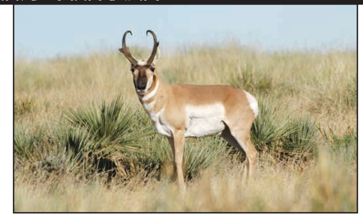
Pronghorn antelope are among the many animals found at Caprock.

The geology of the park greatly affects the flora and fauna. Most sites above the escarpment are on the High Plains and are short-grass prairie, which includes blue grama, buffalograss and sideoats grama. The canyons in the western portion of the park support several species of juniper as well as scrub oak. The bottomland sites along the Little Red River and its tributaries support tall and mid-level grasses including Indian grass, Canada wildrye and little bluestem, cottonwood trees, wild plum thickets and hackberries. The park abounds with wildflowers in the spring and has a variety of yuccas and multi-flowering cacti.