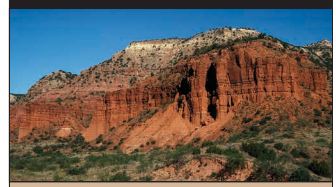
The harsh, yet beautiful terrain at Caprock Canyons is distinguished by steep escarpments, exposed red sandstones and deep, highly eroded and rugged canyons.

THE PARK WAS PURCHASED IN 1975 IN ORDER TO PRESERVE A LARGE AREA OF RUGGED CANYONS ON THE EASTERN MARGIN OF THE HIGH PLAINS AND FOR PUBLIC RECREATION IN THE SCENIC, RUGGED CANYON COUNTRY AT THE EDGE OF THE CAPROCK.