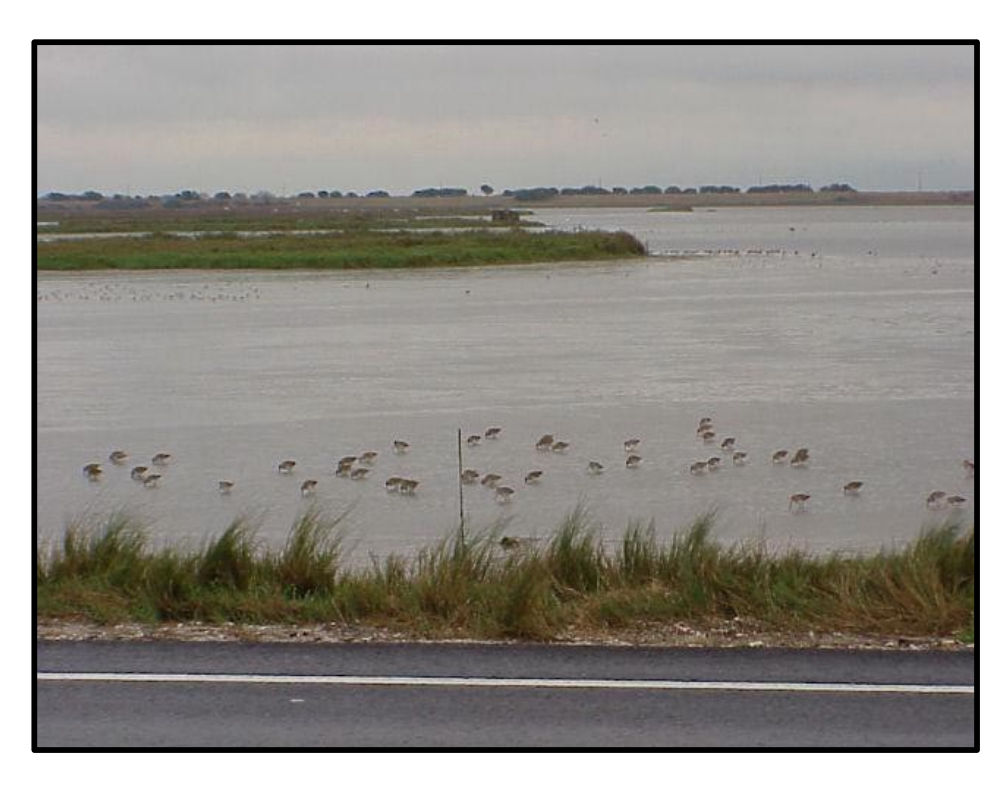
Figure 24(a). Shorebirds and wading birds in the extensive estuarine habitats at Egery Flats off FM 136.