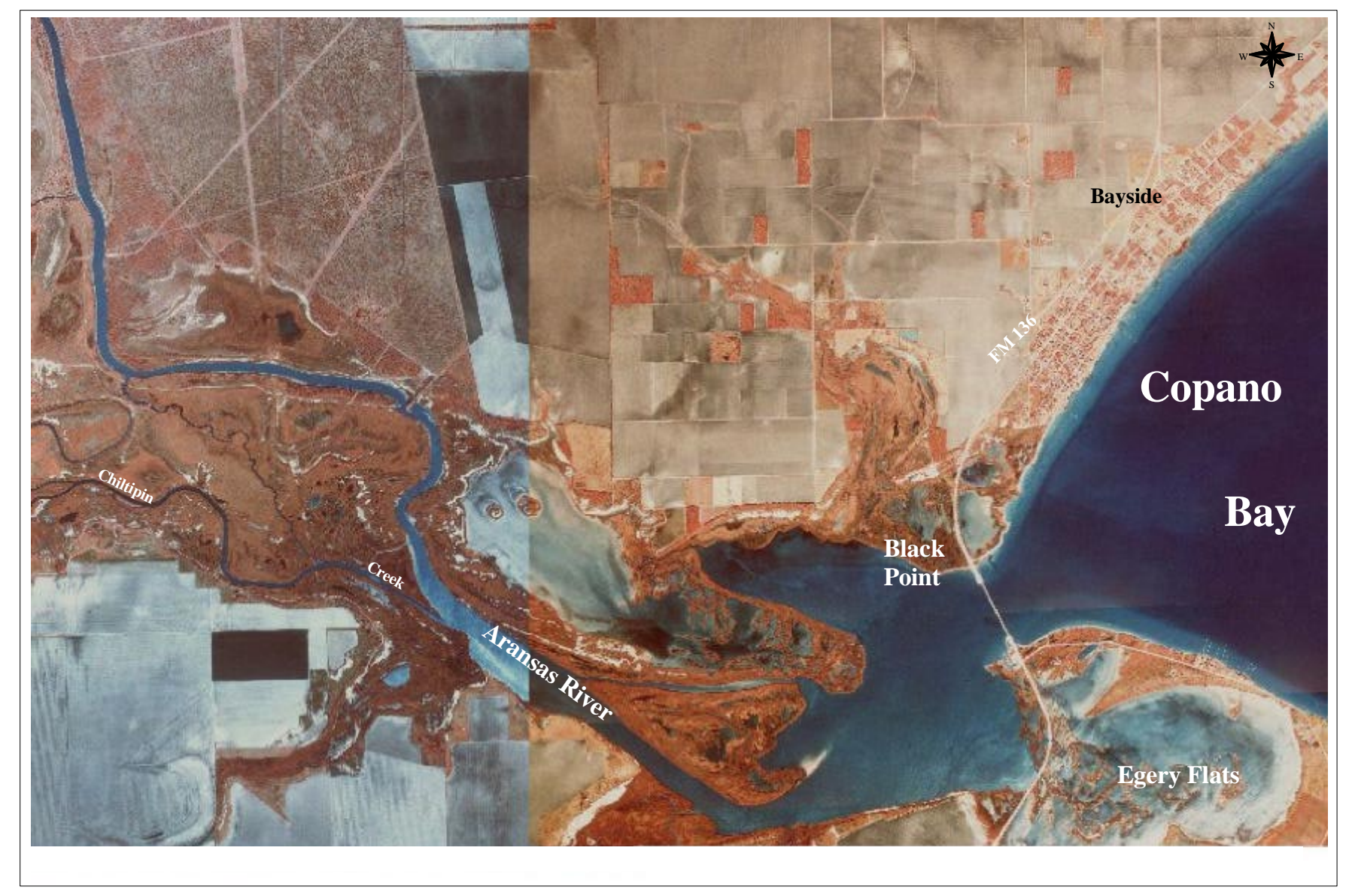
Figure 22. Extensive estuarine wetlands of the Aransas River Delta, Copano Bay (Aransas River Tidal, TNRCC stream segment 2003).