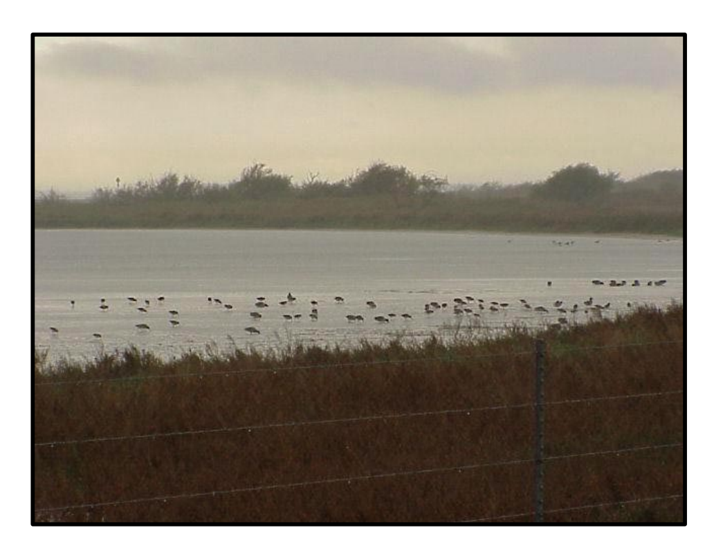
Figure 24 (b). Shorebirds and wading birds in the extensive estuarine habitats at Egery Flats off FM 136.