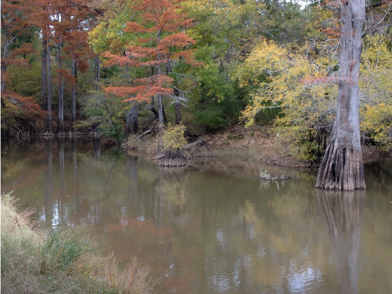
Figure 2. Photograph of a typical collecting site for Kisatchie painted crayfish on Little Cypress Creek (Hwy 59).