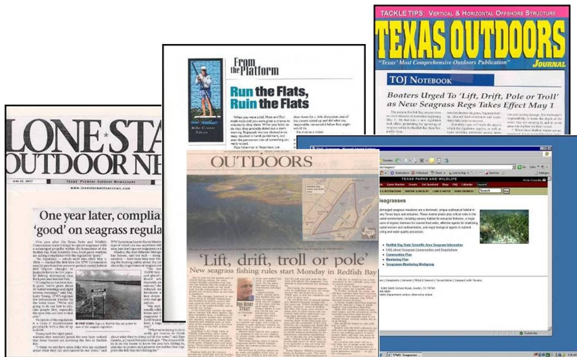
Figure 4.1. Various media materials for educating the public about the importance of Texas seagrasses.

Strategy I.2 outlines ways to inform the general public by using various media types such as press releases, radio announcements, media events, educational videos, and websites. Except for the websites, these activities are ongoing and opportunistic, depending on project completions, time of year, funding availability. The websites are maintained continuously, one by The Nature Conservancy dedicated specifically to seagrasses and one by Texas Parks and Wildlife Department, hosting a webpage with links to the Seagrass Conservation Plan for Texas, Seagrass Monitoring Plan, and information about the Seagrass Monitoring Workgroup. Two other Actions under this strategy in the 1999 Seagrass Education Plan have been modified to have more realistic goals, such as eliminating inserts with voter registrations and adding information in with hunting and fishing license brochures.