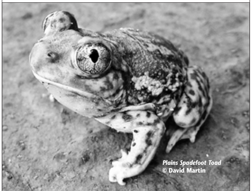
Plains Spadefoot Toad