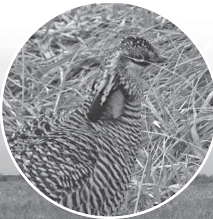
Tympanuchus cupido attwateri

There are currently about 90 Attwater's prairie-chickens in the wild. These can be found in three populations along the coastal prairie.