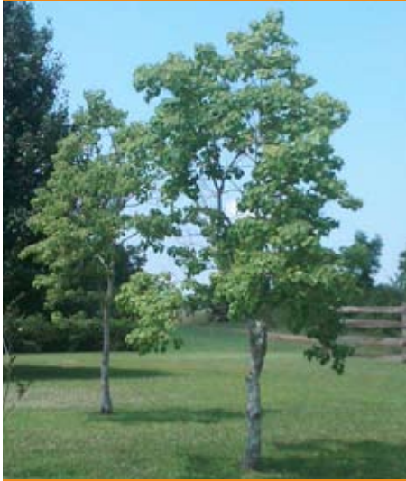
Two young Chinese tallow trees stand in a well-manicured Cass County, Texas yard.

Terrestrial and aquatic exotic invasive species are becoming more and more prevalent. Many exotic species are already threatening the delicate balance of plants and animals in several Texas ecosystems. Keep an eye out for invaders and take care when transplanting flora or fauna so that you don't unknowingly spread a noxious invader right into your front yard!