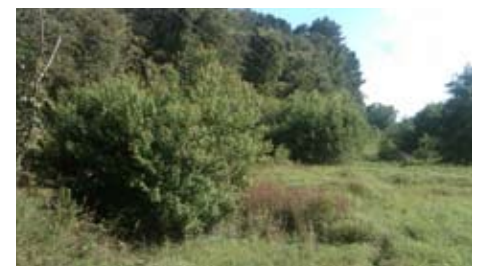
Chinese tallow trees colonize and thrive on the wet banks of Black Bayou in Cass County.

Contact your local Natural Resource Conservation Service (NRCS), county extension agent, or TPWD biologist to find out the best methods of controlling tallow and growing local flora in your county.