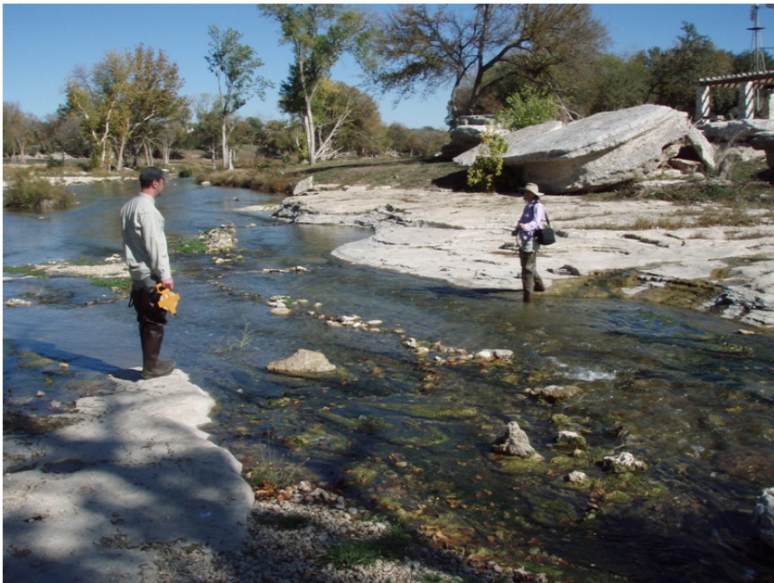
Figure 3. The portion of the riffle sampled for benthic macroinvertebrates at Pace Park on Salado Creek.