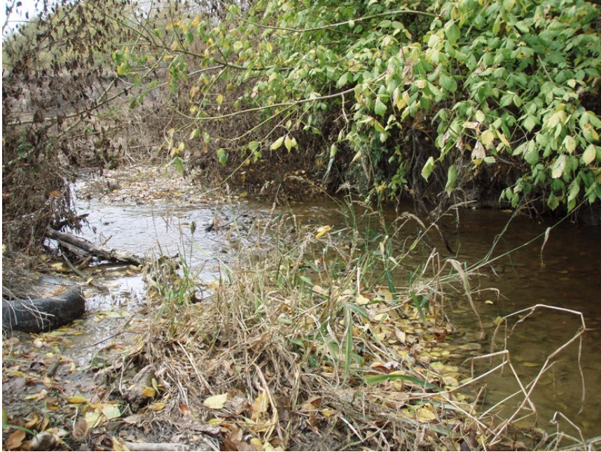
Figure 4. Upstream look at the riffle habitat sampled on Tehuacana Creek.