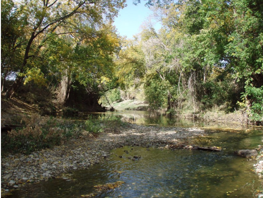
Figure 2. Leon River at FM 1829 looking upstream at the riffle sampled for benthic macroinvertebrates.

Benthic macroinvertebrate samples were collected from a riffle upstream of the FM 2491 bridge located approximately six miles east of Waco in McLennan County (Figure 1) on 18 November 2011 (N31.56645, W-97.04913). The riffle substrate consists of large cobble, woody and leaf debris and a fine layer of sediment. Low-hanging canopy cover was present over a large portion of the riffle (Figure 4).