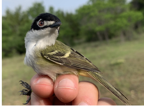
Black-capped Vireo, @bcvi, iNaturalist (CC-BY-NC)