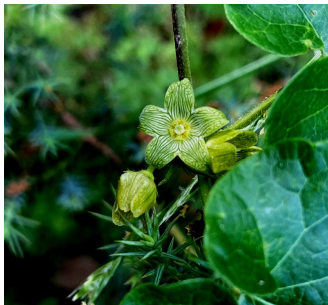
Plateau Milkvine