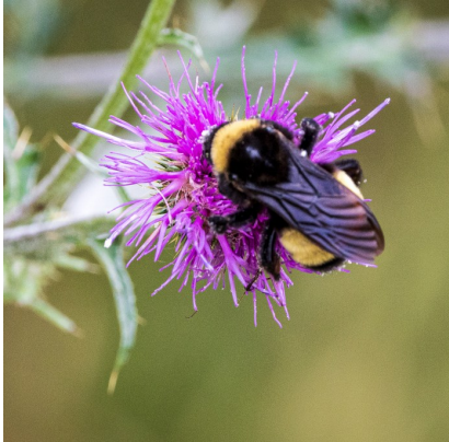
American Bumble Bee

The City Nature Challenge is a global, city-scale urban biodiversity BioBlitz framed as a friendly competition between participating areas.