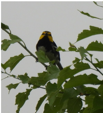
Golden-cheeked Warbler