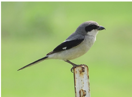
Loggerhead Shrike

The City Nature Challenge is a global, city-scale urban biodiversity BioBlitz. This year's event was a world-wide collaborative effort rather than a competition.