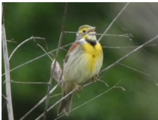
Dickcissel