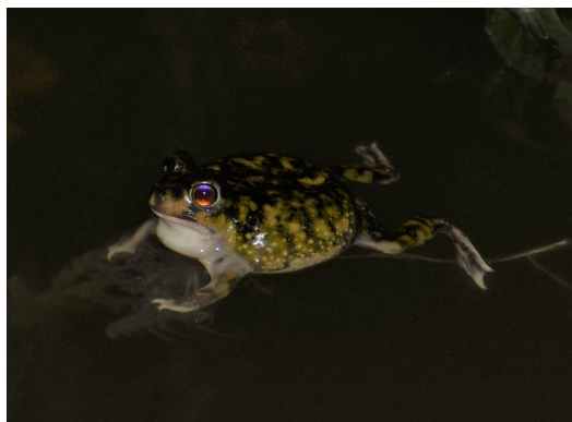
Couch's spadefoot

The City Nature Challenge is a global, city-scale urban biodiversity BioBlitz. This year's event was a world-wide collaborative effort rather than a competition.