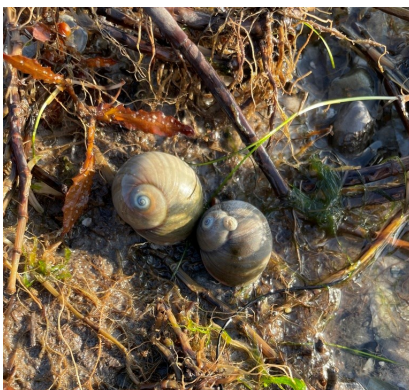
Shark eye , jainbinder, iNaturalist, CCBY-NC