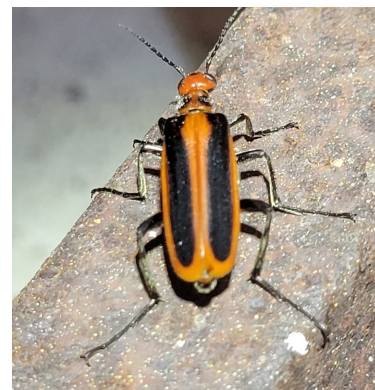
Red-margined blister beetle

The City Nature Challenge is organized by the Natural History Museum of Los Angeles County and the California Academy of Sciences. More information at citynaturechallenge.org