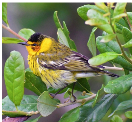
Cape May Warbler