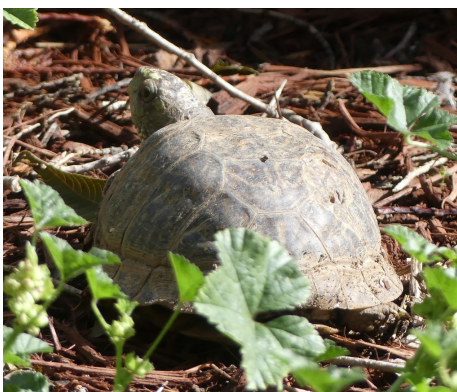
Ornate box turtle , bennyep, iNaturalist, CC BY-NC