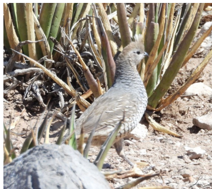
Scaled Quail

The City Nature Challenge is a global, city-scale urban biodiversity BioBlitz. This year's event was a world-wide collaborative effort rather than a competition.