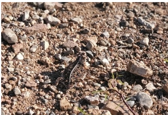
Texas horned lizard