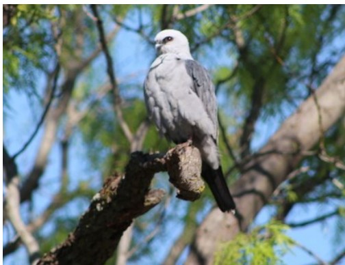
Mississippi Kite