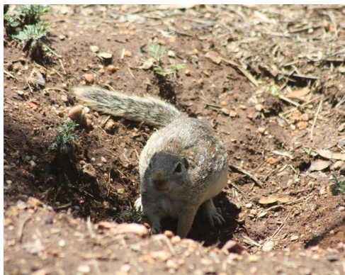
Rio Grande ground squirrel

The City Nature Challenge is a global, city-scale urban biodiversity BioBlitz. This year's event was a world-wide collaborative effort rather than a competition.