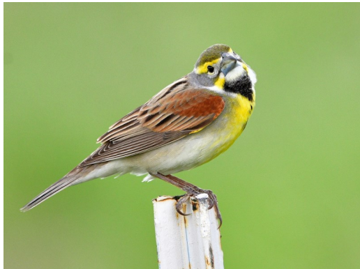
Dickcissel

The City Nature Challenge is a global, city-scale urban biodiversity BioBlitz framed as a friendly competition between participating areas.