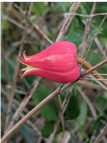
Scarlet Leatherflower