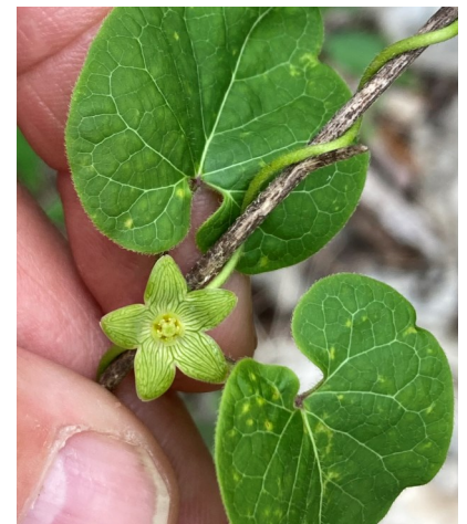
Plateau Milkvine