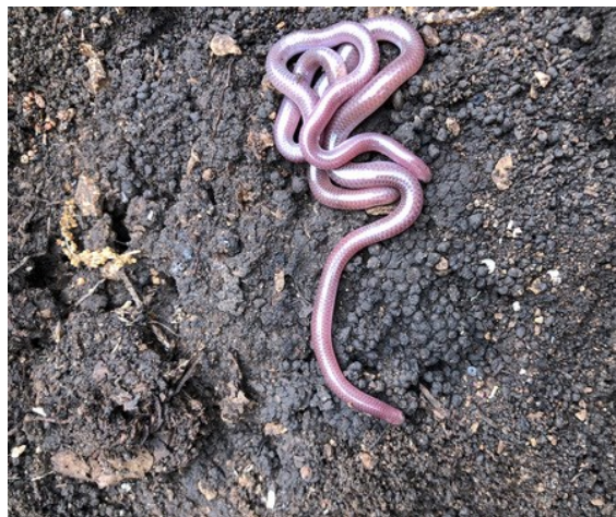
Texas Blind Snake