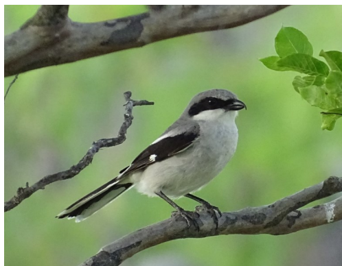
Loggerhead Shrike

The City Nature Challenge is a global, city-scale urban biodiversity BioBlitz framed as a friendly competition between participating areas.