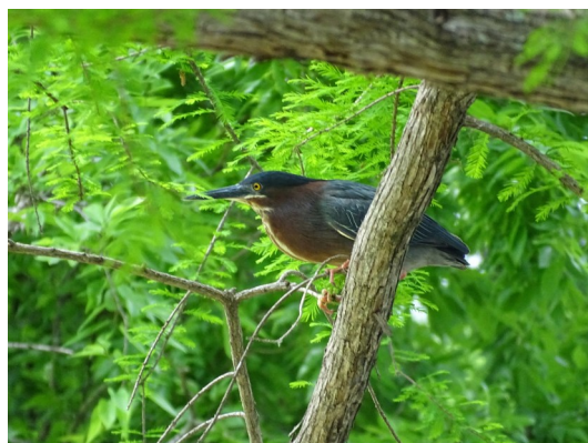
Green Heron