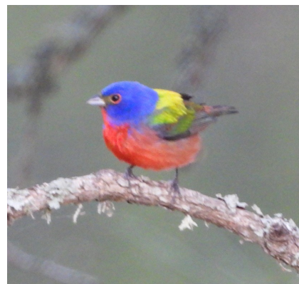
Painted Bunting

The City Nature Challenge is organized by the Natural History Museum of Los Angeles County and the California Academy of Sciences. More information at citynaturechallenge.org