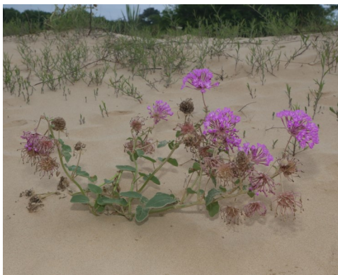
Large-fruited Sand-verbena