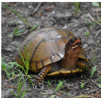
Eastern Box Turtle