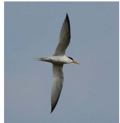
Least Tern