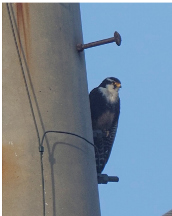
Aplomado Falcon