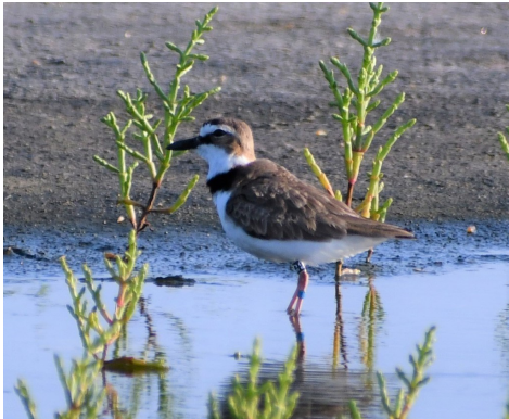
Wilson's Plover

The City Nature Challenge is a global, city-scale urban biodiversity BioBlitz framed as a friendly competition between participating areas.