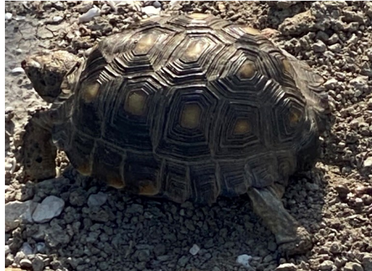
Texas Tortoise

Data collection Apr 29-May 2 Identifications May 3-8