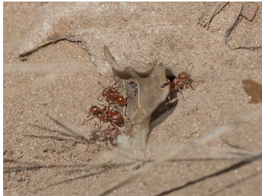
Comanche Harvester Ant