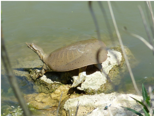
Smooth Softshell Turtle

The City Nature Challenge is a global, city-scale urban biodiversity BioBlitz framed as a friendly competition between participating areas.