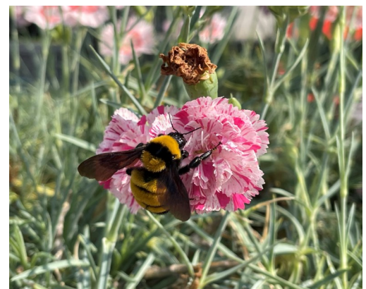
Sonoran Bumble Bee