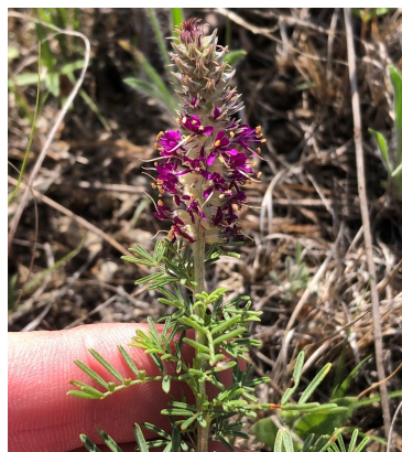
Comanche Peak Prairie Clover