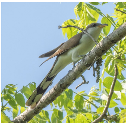
Yellow-billed Cuckoo