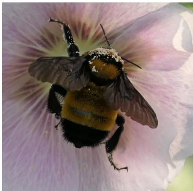
Sonoran Bumblebee