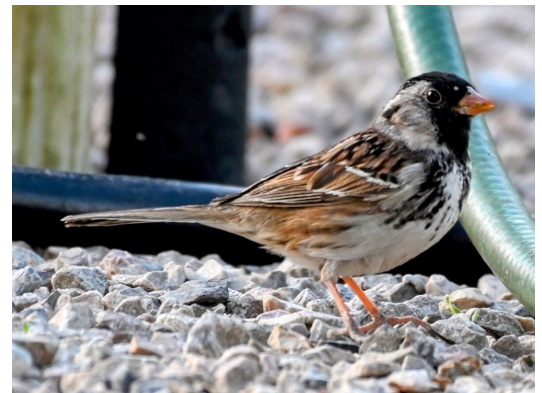
Harris's Sparrow