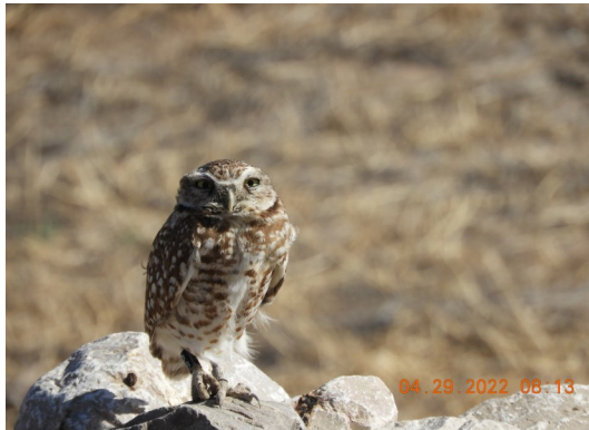
Burrowing Owl