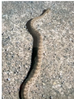
Prairie Rattlesnake , hannatellez, iNaturalist, CCBY-NC