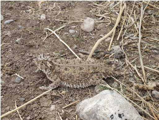
Texas Horned-Lizard

The City Nature Challenge is a global, city-scale urban biodiversity BioBlitz framed as a friendly competition between participating areas.