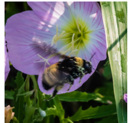
American Bumble Bee