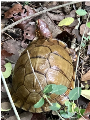
Eastern Box Turtle