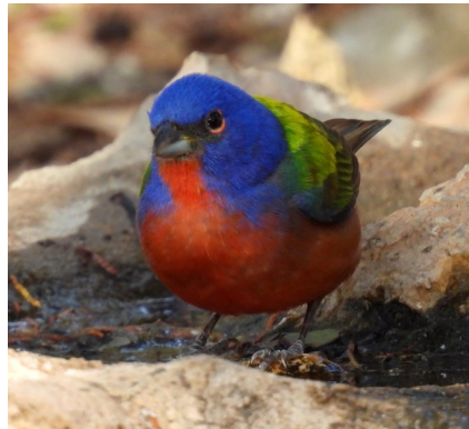
Painted Bunting

Data collection Apr 29-May 2 Identifications May 3-8