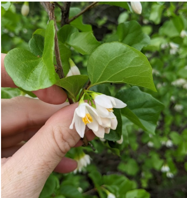
Sycamore-leaf Snowbell

The City Nature Challenge is a global, city-scale urban biodiversity BioBlitz framed as a friendly competition between participating areas.