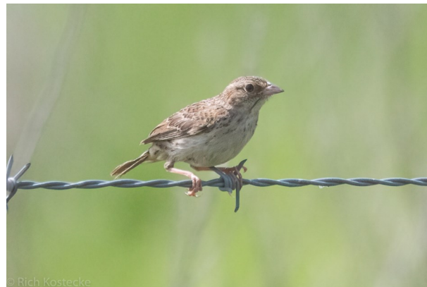
Cassin's Sparrow