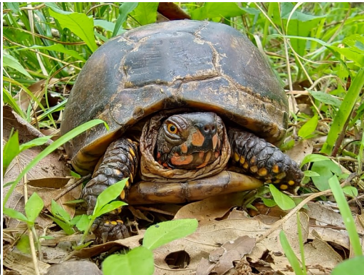
Eastern Box Turtle