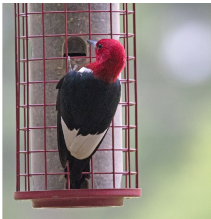
Red-headed Woodpecker