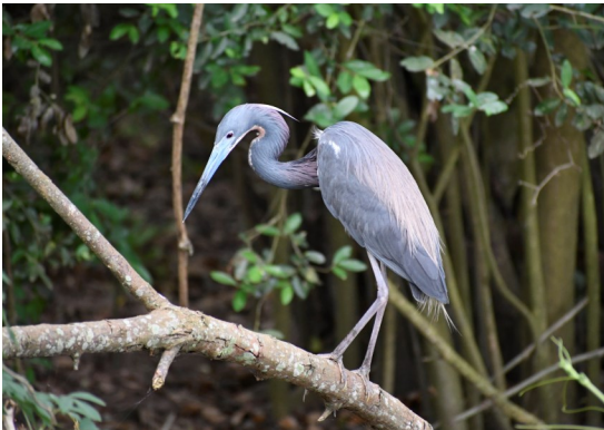
Tri-colored Heron

The City Nature Challenge is a global, city-scale urban biodiversity BioBlitz framed as a friendly competition between participating areas.