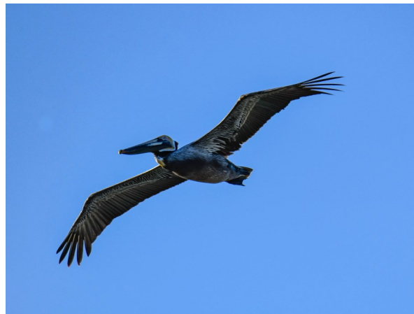
Brown Pelican