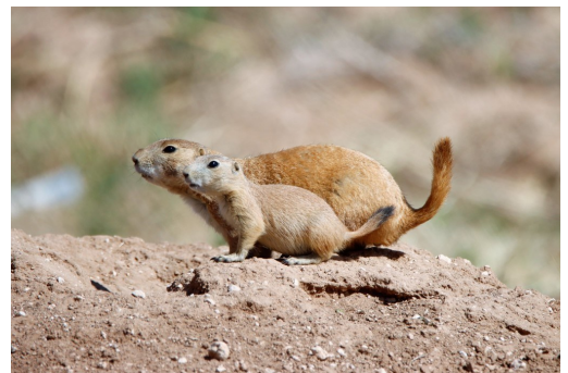
Black-tailed Prairie Dog