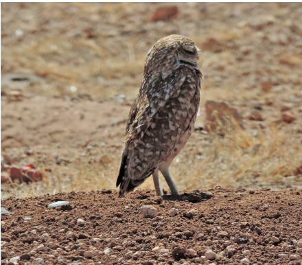
Burrowing Owl

The City Nature Challenge is a global, city-scale urban biodiversity BioBlitz framed as a friendly competition between participating areas.