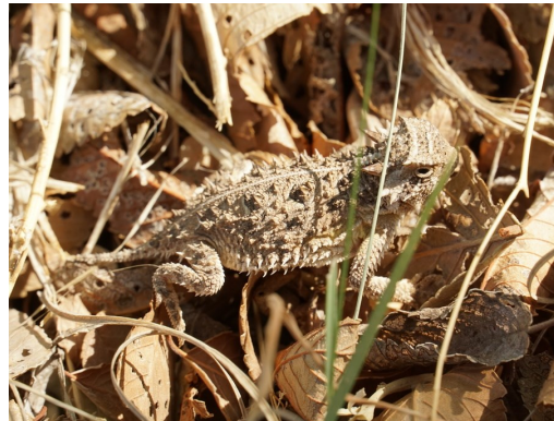
Texas Horned Lizard , whitc32, iNaturalist, CCBY-NC

Data collection Apr 29-May 2 Identifications May 3-8