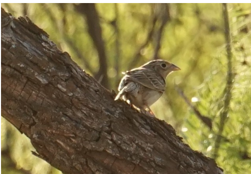
Grasshopper Sparrow , whitc32, iNaturalist, CCBY-NC