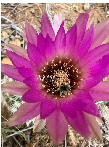
White Lace Cactus