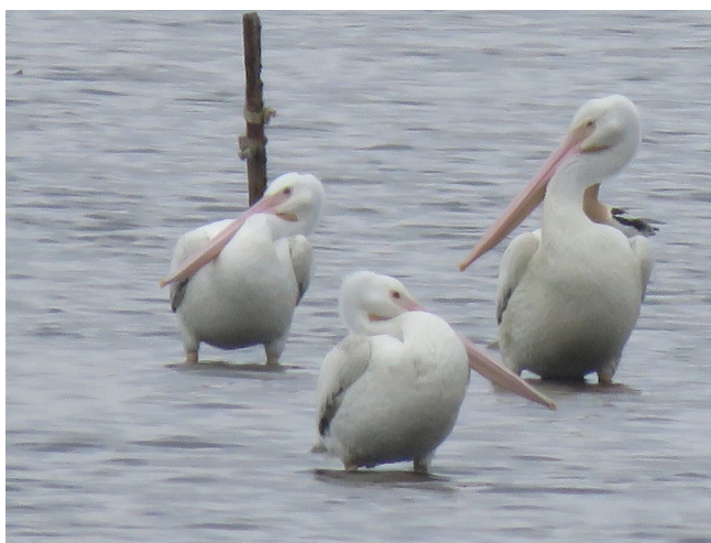
American White Pelican