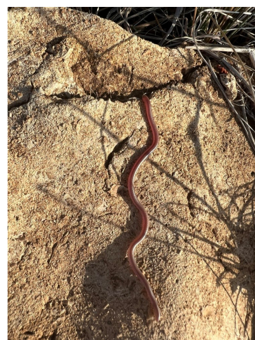
Texas Blind Snake , crazybee, iNaturalist, CCBY-NC