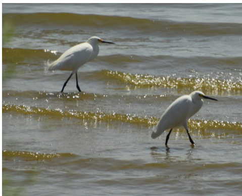
Snowy Egret