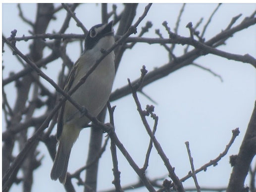
Black-capped Vireo

The City Nature Challenge is a global, city-scale urban biodiversity BioBlitz framed as a friendly competition between participating areas.