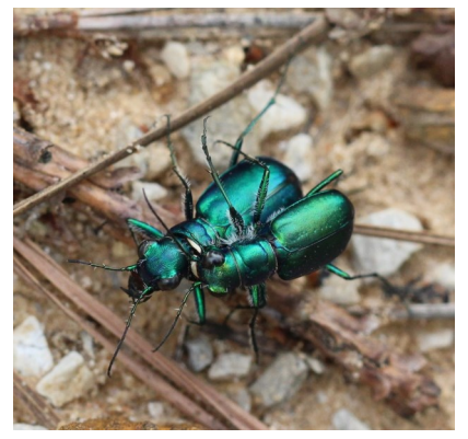
Rugate Tiger Beetle

The City Nature Challenge is a global, city-scale urban biodiversity BioBlitz framed as a friendly competition between participating areas.