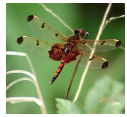
Calico Pennant