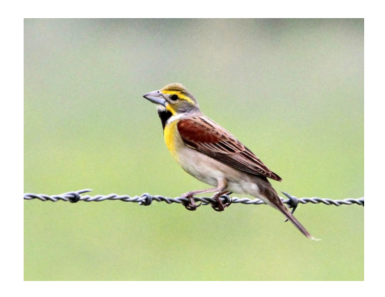
Dickcissel