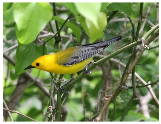
Prothonotary Warbler