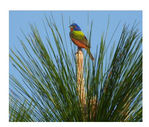
Painted Bunting