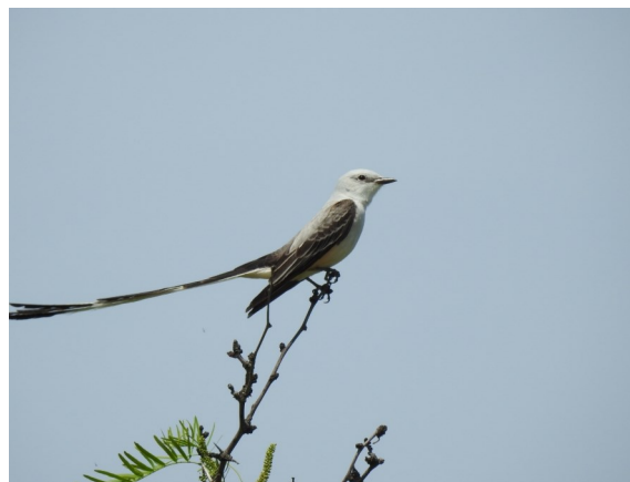
Scissor-tailed Flycatcher