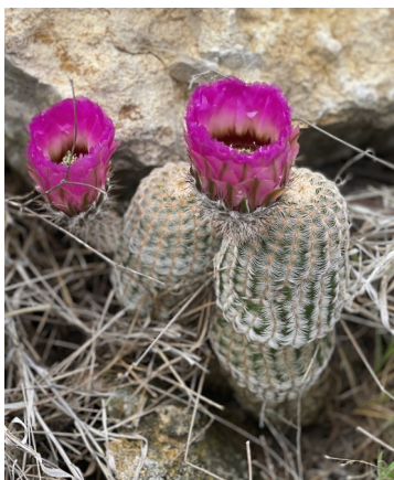
White Lace Cactus