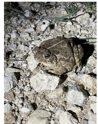
Woodhouse's Toad