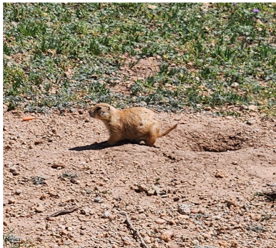
Black-tailed Prairie Dog