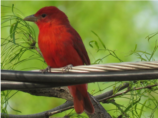
Summer Tanager

The City Nature Challenge is a global, city-scale urban biodiversity BioBlitz framed as a friendly competition between participating areas.