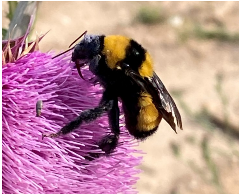
Sonoran Bumble Bee