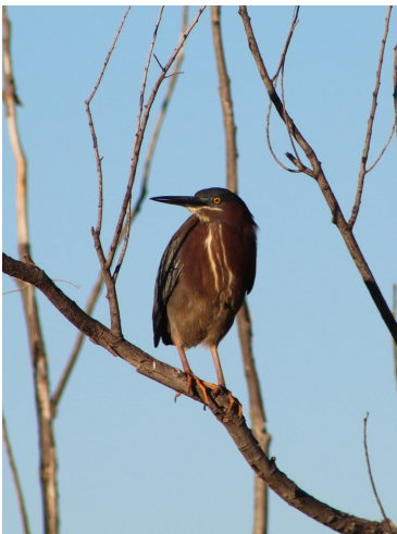
Green Heron