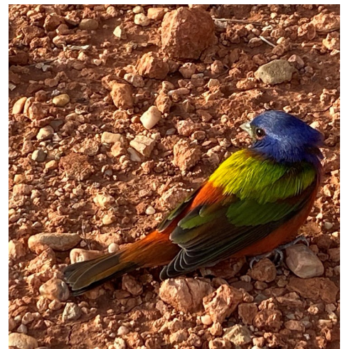
Painted Bunting