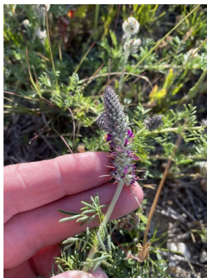
Comanche Peak Prairie Clover