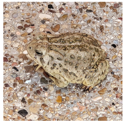
Woodhouse's Toad