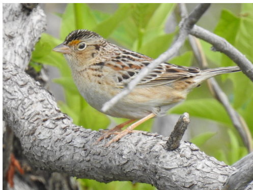
Grasshopper Sparrow

The City Nature Challenge is a global, city-scale urban biodiversity BioBlitz framed as a friendly competition between participating areas.