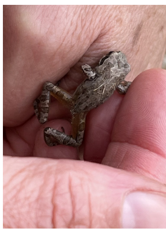
Strecker's Chorus Frog , jhamby, iNaturalist, CCBY