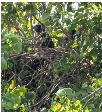
Bald Eagle , Denver Kramer, iNaturalist, CCBY-NC