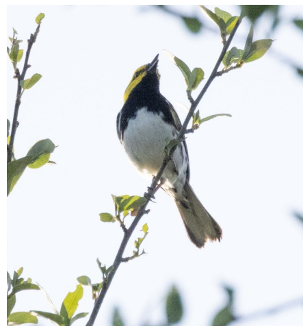
Golden-cheeked Warbler