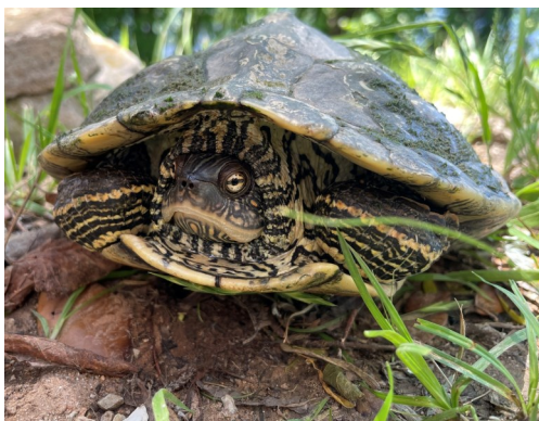
Texas Map Turtle