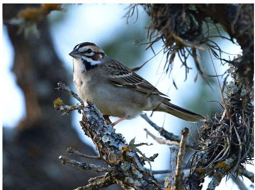
Lark Sparrow

The City Nature Challenge is a global, city-scale urban biodiversity BioBlitz framed as a friendly competition between participating areas.