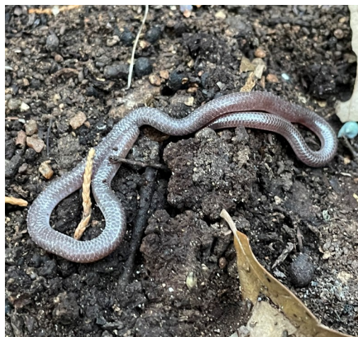
Texas Blind Snake