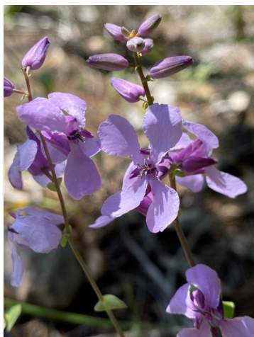
Bracted Jewelflower , Hillary Xu, iNaturalist, CC-BY-NC