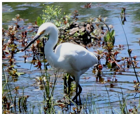
Snowy Egret , Cristy & Jim Wade, iNaturalist, CC*BY-NC