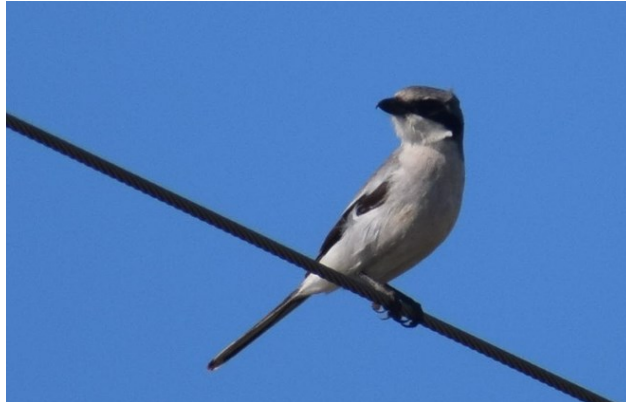
Loggerhead Shrike