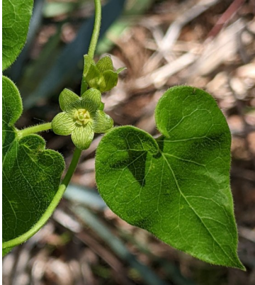
Plateau Milkvine

The City Nature Challenge is a global, city-scale urban biodiversity BioBlitz framed as a friendly competition between participating areas.