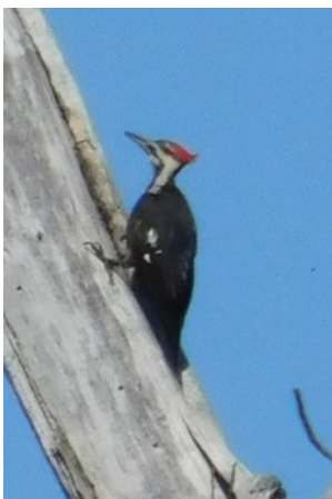
Pileated Woodpecker