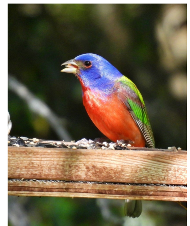
Painted Bunting