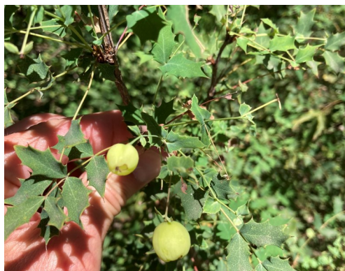
Texas Barberry