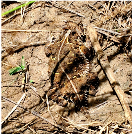
Texas Horned Lizard