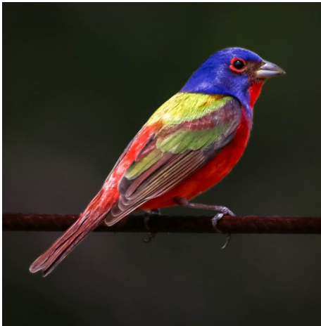
Painted Bunting