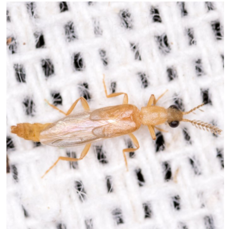
Cenophengus pallidus