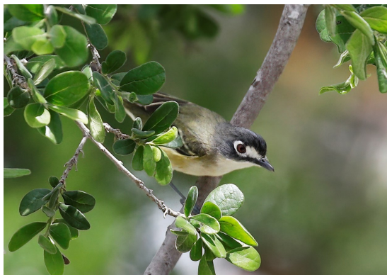
Black-capped Vireo

The City Nature Challenge is a global, city-scale urban biodiversity BioBlitz framed as a friendly competition between participating areas.