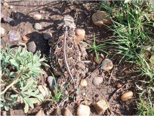
Texas Horned Lizard

The City Nature Challenge is a global, city-scale urban biodiversity BioBlitz framed as a friendly competition between participating areas.