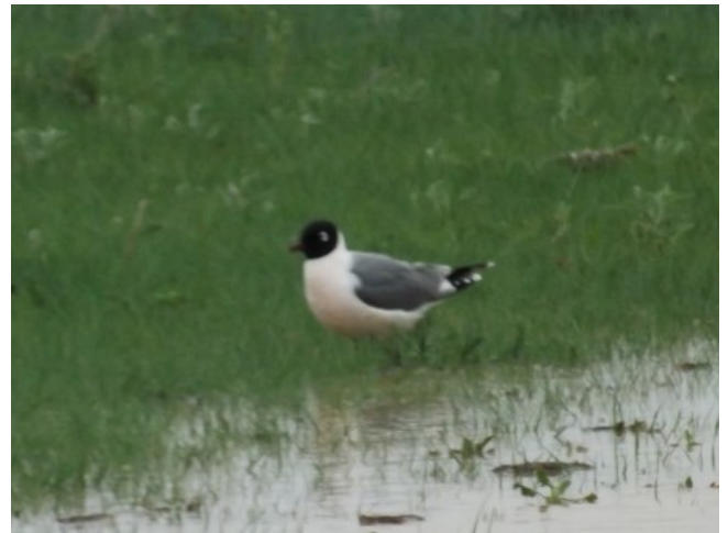
Franklin's Gull

Woodhouse's Toad, Anaxyrus woodhousii Lark Bunting, Calamospiza melanocorys Black-tailed Prairie Dog, Cynomys ludovicianus Brewer's Blackbird, Euphagus cyanocephalus Franklin's Gull, Leucophaeus pipixcan Texas Horned Lizard, Phrynosoma cornutum Common Grackle, Quiscalus quiscula Ornate Box Turtle, Terrapene ornata