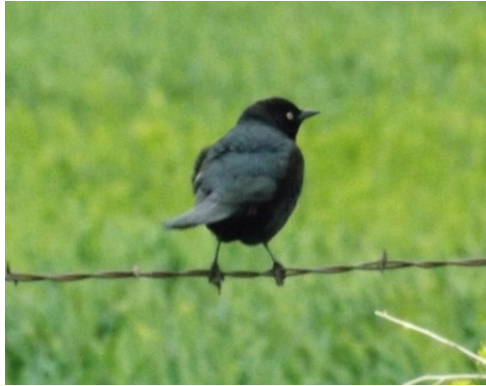
Brewer's Blackbird , @momofthewild, iNaturalist (CC-BY-NC)