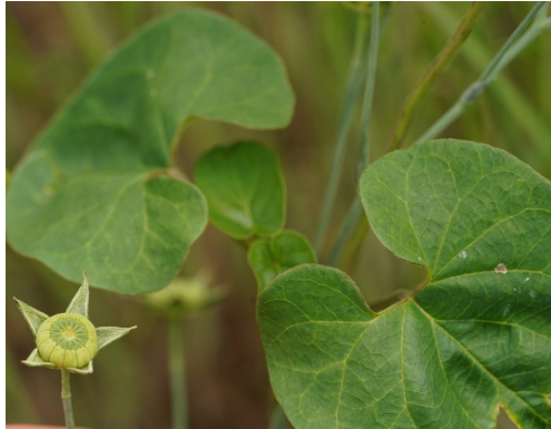
Plateau Milkvine