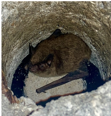
Cave Myotis