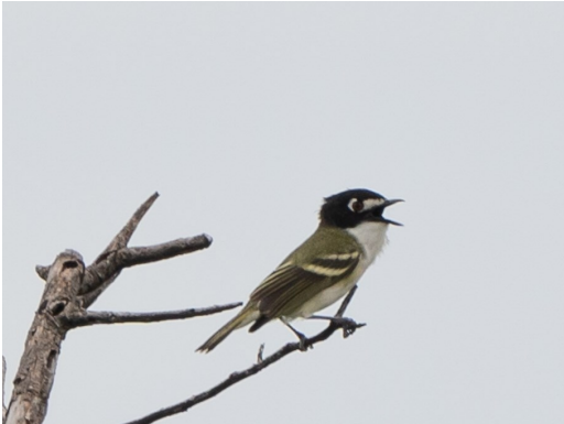
Black-capped Vireo

The City Nature Challenge is a global, city-scale urban biodiversity BioBlitz framed as a friendly competition between participating areas.