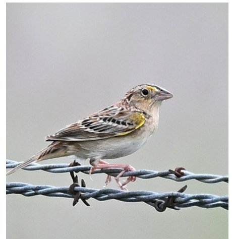
Grasshopper Sparrow