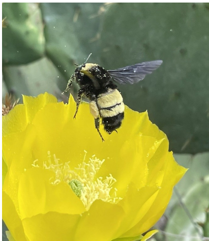
American Bumble Bee