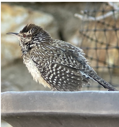
Cactus Wren