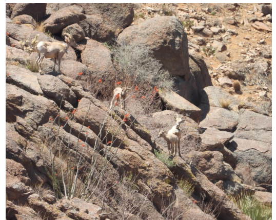
Bighorn Sheep