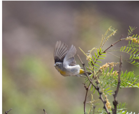
Virginia's Warbler