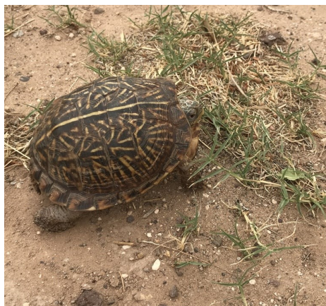
Ornate Box Turtle