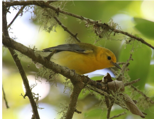
Prothonotary Warbler