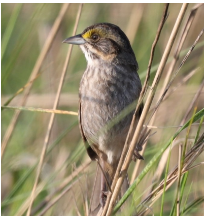
Seaside Sparrow