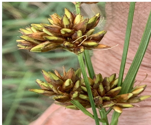
Indianola Beaksedge