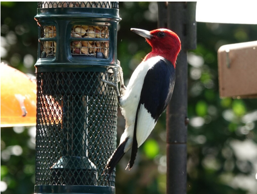
Red-headed Woodpecker

The City Nature Challenge is a global, city-scale urban biodiversity BioBlitz framed as a friendly competition between participating areas.