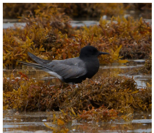
Black Tern