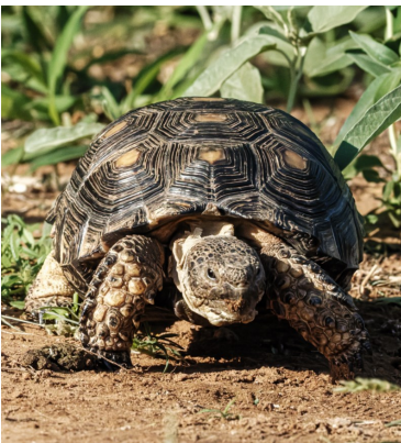
Texas Tortoise