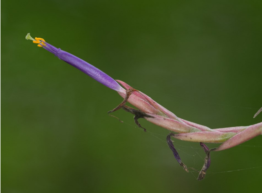
Bailey's Ballmoss

The City Nature Challenge is a global, city-scale urban biodiversity BioBlitz framed as a friendly competition between participating areas.