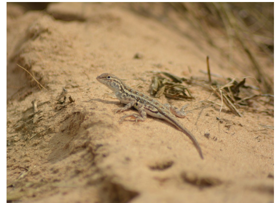
Keelless Earless Lizard , @bcfl14, iNaturalist (CC-BY-NC)