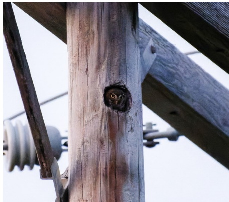
Elf Owl , @aquilus_aquila, iNaturalist (CC-BY-NC)