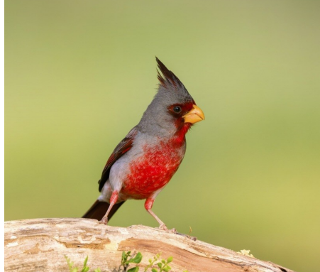
Pyrrhuloxia , @cdsanders, iNaturalist (CC-BY-NC)