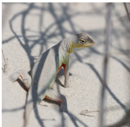
Keeled Earless Lizard