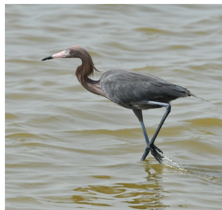
Reddish Egret