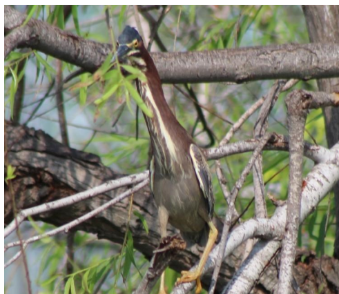
Green Heron