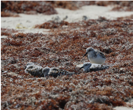
Sanderling

The City Nature Challenge is a global, city-scale urban biodiversity BioBlitz framed as a friendly competition between participating areas.