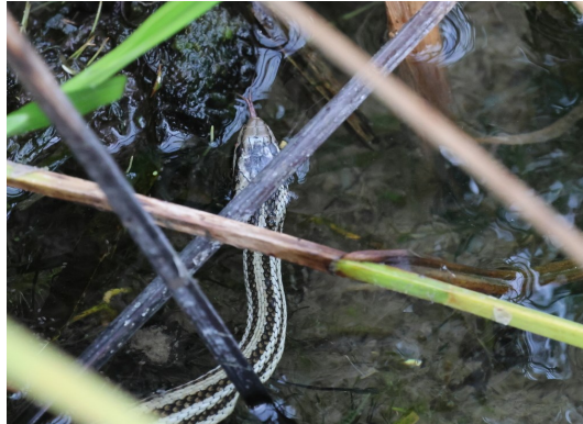
Saltmarsh Snake