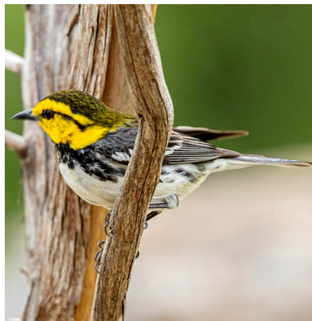
Golden-cheeked Warbler