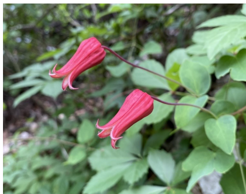
Scarlet Leather Flower