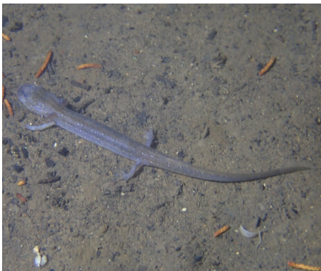
Cascade Caverns Salamander