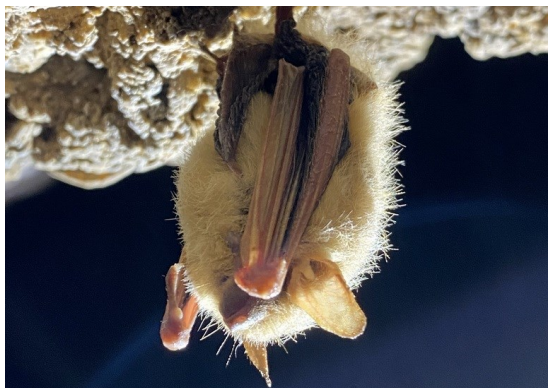
Tricolored Bat

The City Nature Challenge is a global, city-scale urban biodiversity BioBlitz framed as a friendly competition between participating areas.