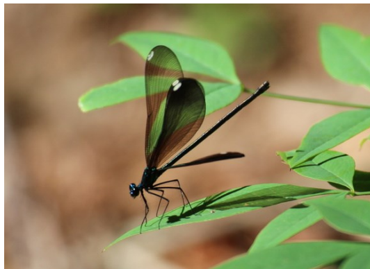
Ebony Jewelwing , @janesmoney, iNaturalist (CC-BY-NC)