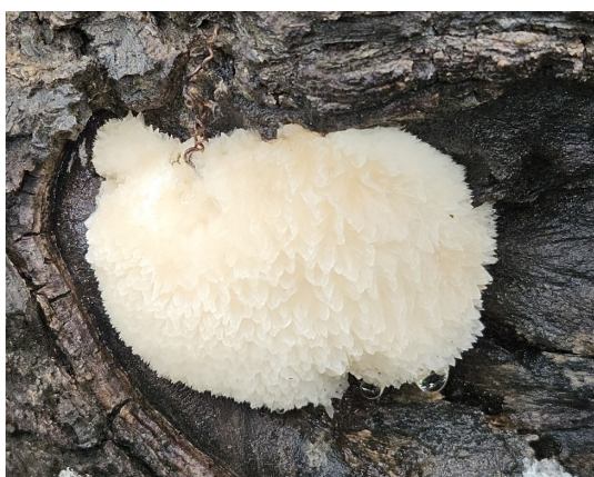
Powderouff Bucket