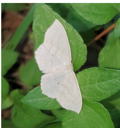
Large Lace-border Moth