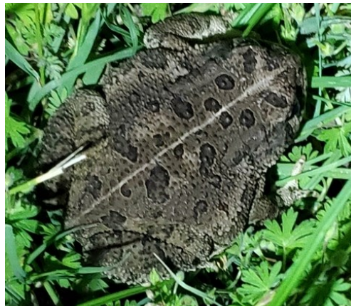
Woodhouse's Toad