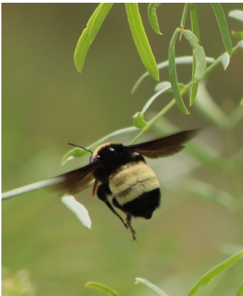
American Bumble Bee