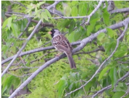
Harris's Sparrow