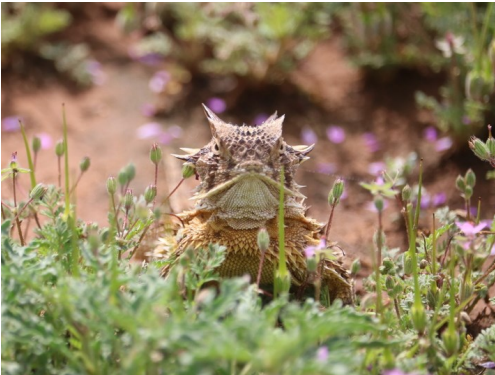
Horned Lizard

The City Nature Challenge is a global, city-scale urban biodiversity BioBlitz framed as a friendly competition between participating areas.