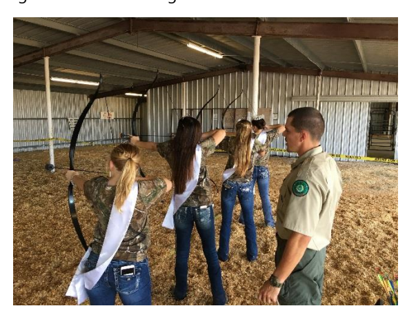
National Archery in Schools Program is featured at the annual festival youth day. Here Choke Canyon SP staff teach the Lonesome Dove Festival pageantry archery.