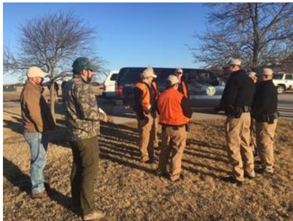
January 30-31st, GW Academy